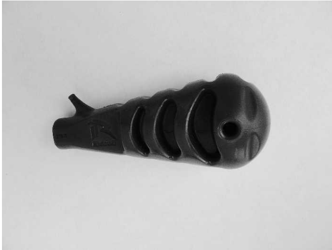
Figure 2. Riddell insertion tool (part 27515; Riddell Sports, Inc, Elyria, OH).