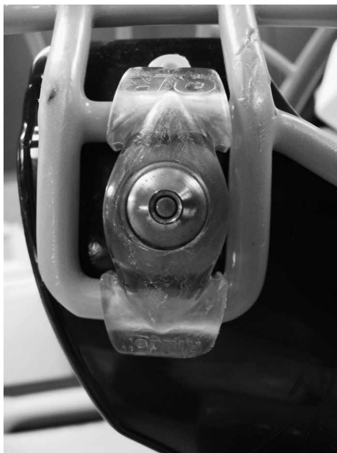
Figure 1. Quick Release Face Guard Attachment System (Riddell Sports, Inc, Elyria, OH) side clip attaches the face mask to the Revolution IQ (Riddell Sports, Inc) football helmet.

Data collection was conducted 4 separate times in a climate-controlled environment on the campus of the Division III institution. Two senior-level athletic training students (M.S., A.G.) performed the techniques of the QR side-clip removal in a similar manner on every tested helmet regardless of having different hand dominance