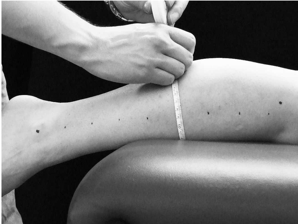
Figure 2. Circumference measurement markings.

were collected for 5 minutes, and the average of each was used for statistical analysis.