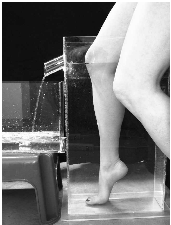
Figure 3. Volumetric water displacement procedure.

Endurance Ratio. Total work of the gastrocnemius muscle was measured with a CYBEX NORM dynamometer