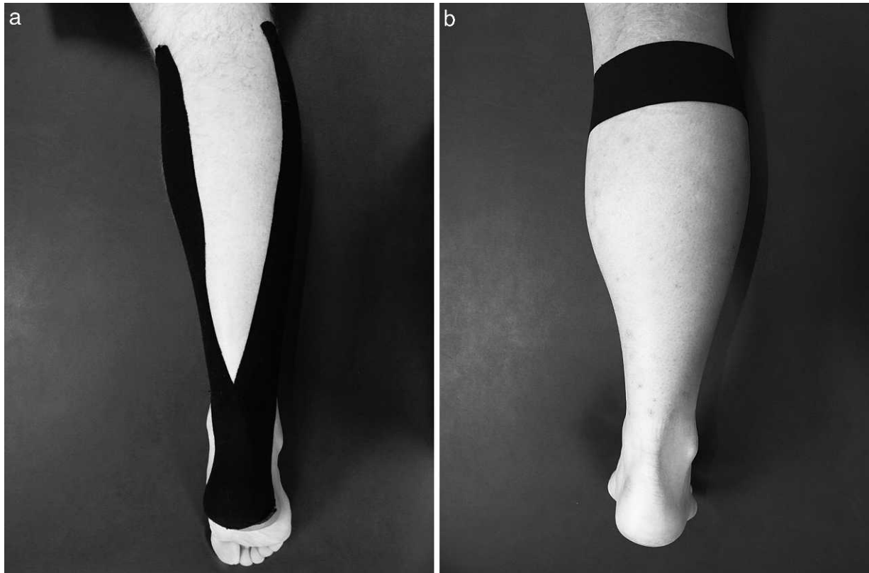
Figure 5. A, Treatment Kinesio Taping on gastrocnemius. B, Sham Kinesio Taping on gastrocnemius.

displacement yielded no differences among the treatment, sham, or control groups ( F_{2,58} range, 0.02–0.51; P > .05 ) or among test days ( F_{2,116} range, 0.05–2.33; P > .05 ). Means and standard deviations for all variables are provided in Table 2.