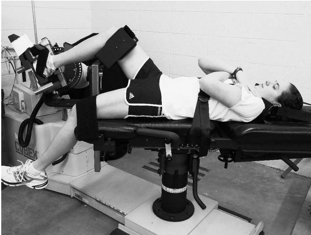
Figure 4. CYBEX NORM (CYBEX International, Inc, Ronkonkoma, NY) patient positioning.

(CYBEX International, Inc, Ronkonkoma, NY; Figure 4). Researchers have shown that the dynamometer is a reliable measure of isokinetic muscle strength at 120°/s ( r = 0.82 ) 11 and at 60°/s, 120°/s, and 180°/s ( r = 0.90 ). 32 The CYBEX NORM isokinetic dynamometer is a self-calibrating device. Participants were positioned supine with their right legs secured into the thigh stabilizer and their right feet secured to the foot plate. The thigh stabilizer was adjusted so that their knees were in 90° of flexion. The input-arm penetration and foot-plate penetration were set so that the ankle axis of rotation was in line with the axis of the dynamometer. Each participant's ROM then was assessed. Mechanical ROM stops were positioned according to each participant's end ROMs. Each participant's specific ROM was used for all subsequent test days. The velocity of the CYBEX NORM was set at 180°/s. Next, we recorded the position markings. After setup procedures were concluded, participants performed 1 set of 30 concentric plantar-flexion and dorsiflexion repetitions with their right legs. Total work data were collected. Endurance ratio in joules was calculated automatically by the CYBEX NORM by dividing the total work of the last 15 repetitions by the total work of the first 15 repetitions and multiplying by 100. 16