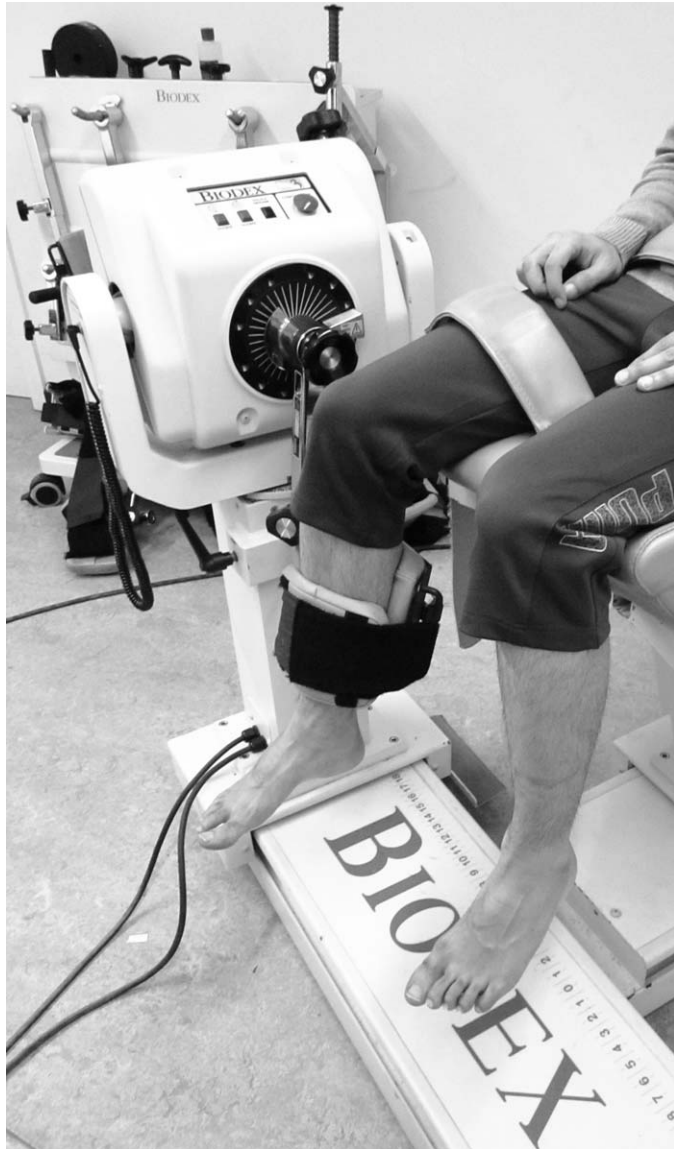
Figure 2. Joint position sense measurement of the knee joint.

we computed the standardized mean-difference effect size (ES) corrected for small-sample bias (Hedges g ) for JPS values from pre-exercise to postexercise for each group and corresponding change scores between groups. Effect sizes equal to or less than 0.2 are thought to be small; around 0.5, medium; and greater than 0.8, large. 19