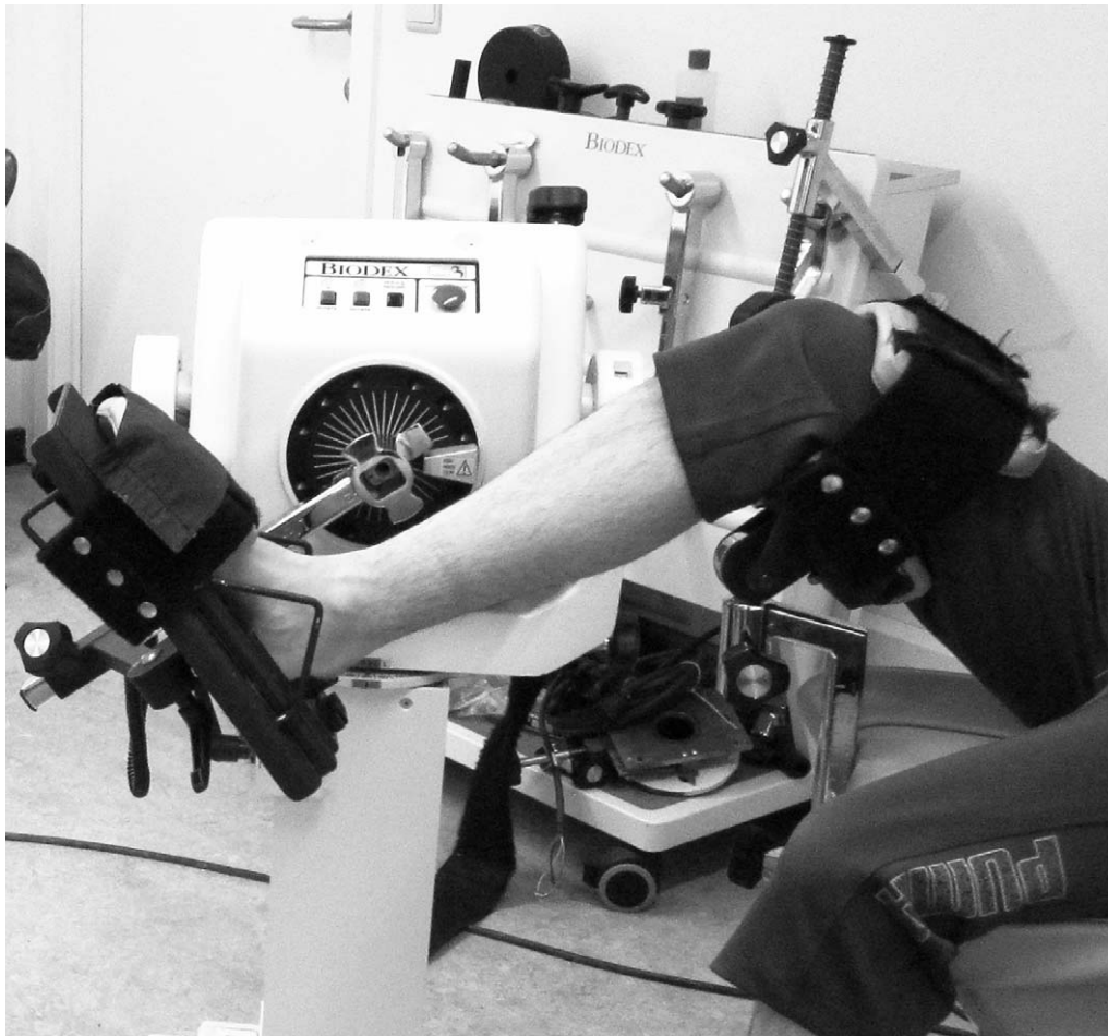
Figure 1. Joint position sense measurement of the ankle joint.

in the working range of the knee during daily weight-bearing activities. 16