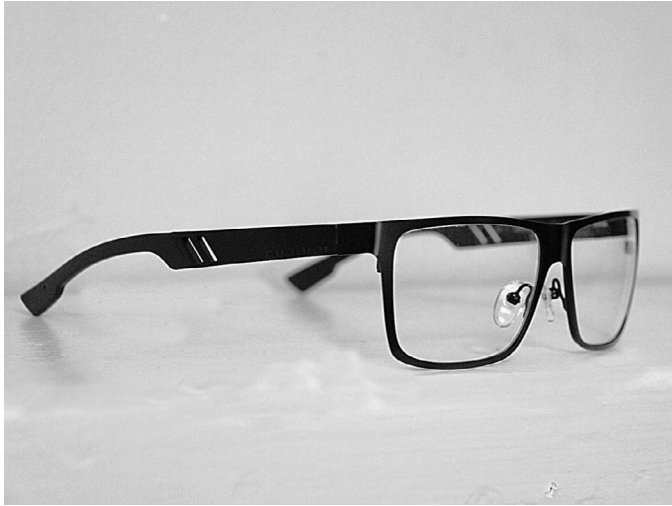
Figure 2. Computer gaming glasses (Gunnar Optiks, Rancho Santa Fe, CA).

syndrome. Decreasing the stimulation of these tissues may allow successful restoration of homeostasis within the system. The filtering of blue light may lessen the stimulation of the visual cortex by decreasing activation of the S cones.