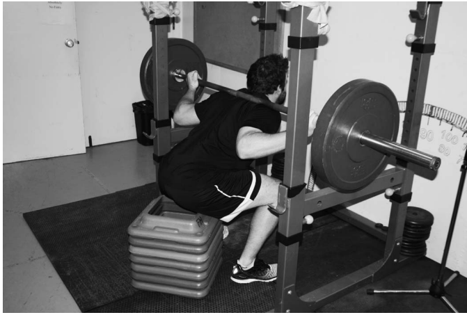
Figure 2. A participant demonstrates the depth achieved during all back squats. We stacked 5-cm spacers so that when the participants were at the end phase of the eccentric portion of the squat repetition, their femurs were parallel to the floor. Participants were required to touch the top of the stack during each squat repetition.

protocol), 2 (24 hours post-DOMS protocol), and 3 (48 hours post-DOMS protocol). Whereas DOMS was not immediately evident after testing session 1, we chose this time to foam roll because massage has been shown to enhance blood lactate removal and tissue healing. 18 Furthermore, participants foam rolled after testing sessions 2 and 3 because the intensity of DOMS increases within the first 24 hours and peaks around 48 hours postexercise. 4 We chose these time points because no empirical evidence recommending the most optimal duration and timing of postexercise foam rolling was available.