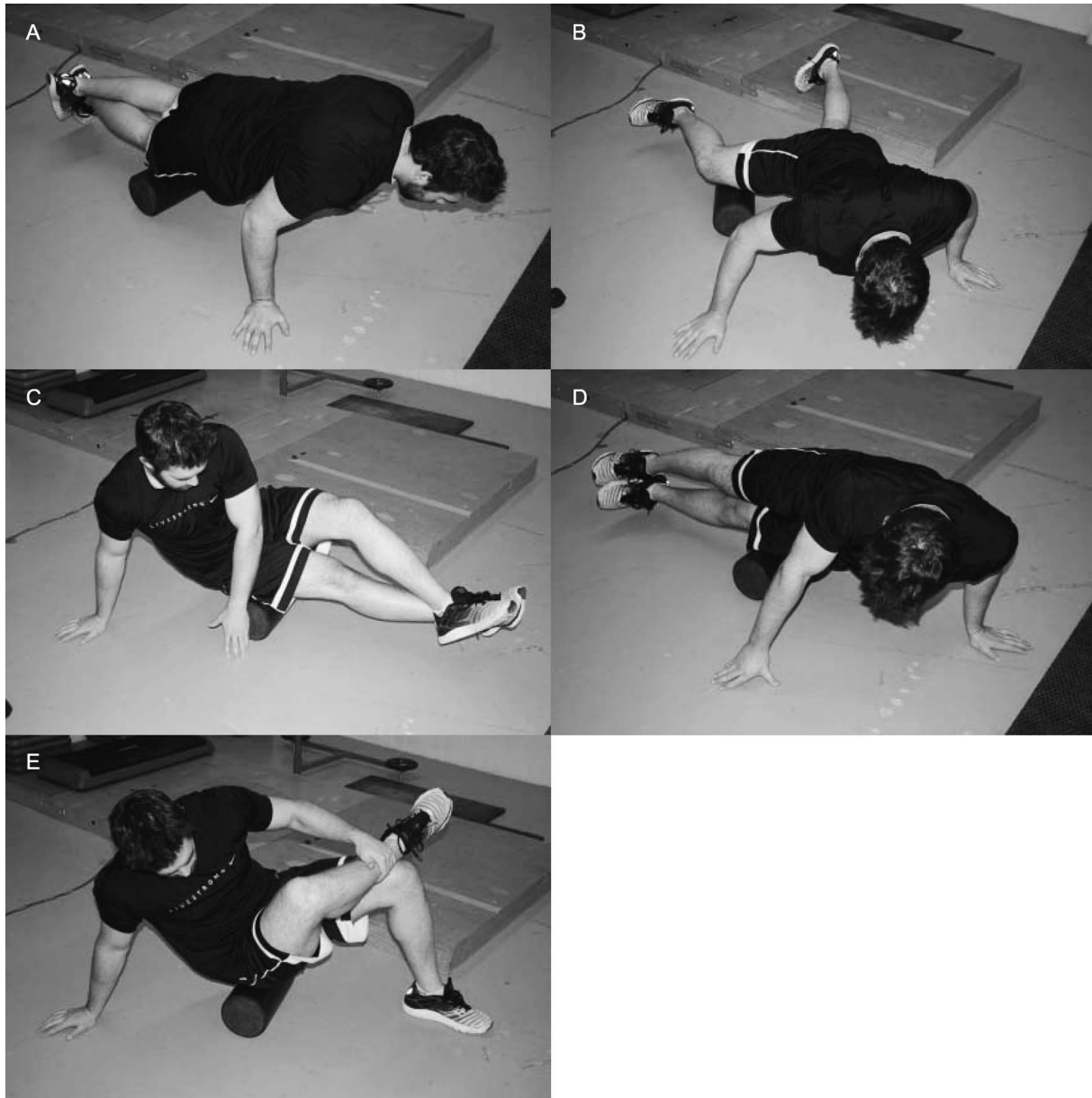
Figure 3. A participant demonstrates the 5 muscle groups foam rolled and the technique used for each muscle group. Foam rolling consisted of 45 seconds of rolling for each muscle in the left lower extremity, 15 seconds of rest, 45 seconds on the right lower extremity, and 15 seconds of rest for all muscles in the following order: A, quadriceps, B, adductors, C, hamstrings, D, iliotibial band, and E, gluteals. Total foam-rolling time was 20 minutes (15 minutes of rolling and 5 minutes of rest).

nondominant foot. Lights were set at a height of 0.4 m above the ground. Participants were instructed to start and encouraged to give maximal effort when they were ready. Time started when they crossed the first gate and ended when they crossed the same gate at the end of the test. The faster of the 2 trials was used for analysis.