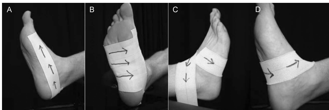
Figure 2. Taping techniques. Low-dye technique: A , an anchor strip around the periphery of the foot, and B , plantar strips pulling the arch lateral to medial. Navicular-sling technique: C , lateral view showing the tape traveling under the foot, and D , medial view showing the tape pulling upward on the navicular and the arch.

Navicular-Drop Procedure. Using butcher-block paper, we constructed a template for each participant before measuring navicular drop. The purpose of this template was to ensure consistent foot placement for the testing position each time navicular height was measured. The participants marched in place 10 times to make sure they exhibited a natural pattern, and we instructed them to stand in a bipedal stance while the feet were traced.