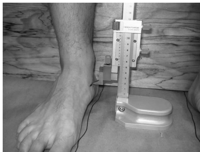
Figure 1. Navicular-height caliper measuring from the floor to the marked navicular tuberosity.

Twenty-five individuals (13 men, 12 women; age = 20.0 ± 1.0 years, height = 172.3 ± 6.6 cm, mass = 70.1 ± 10.2 kg) from a college-aged population volunteered for this study. All participants met the inclusion criteria of having a navicular drop of more than 8 mm (12.9 ± 3.3 mm). Mueller et al 18 measured healthy individuals and reported a mean navicular drop of approximately 7 mm for the right foot. Therefore, we used 8 mm to reflect a sample with some degree of overpronation that could be affected by the use of a taping technique. Participants had no reported history of substantial lower body injury in the 6 months before the study that would affect gait and no acute injury, such as a sprain or strain. An acute injury was defined as any injury that currently caused symptoms of pain, swelling, or reduced function. Participants were also physically active , which was defined as performing 30 minutes of cardiovascular exercise at least 2 days per week to ensure that they could complete the testing protocol. All participants provided written informed consent, and the