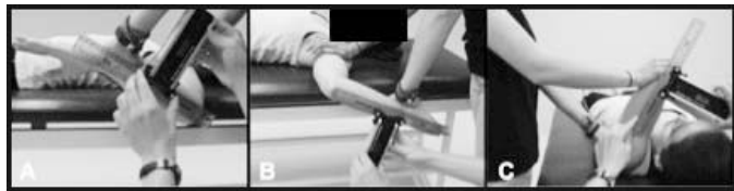
Figure 3. Range-of-motion assessment. A, Internal rotation. B, External rotation. C, Posterior shoulder tightness.

acromial-space distance was defined as the shortest distance between the anterior-inferior tip of the acromion and the superior humeral head (Figure 2B). 17 A 3-trial mean was calculated for each side. Average subacromial-space distance was normalized to height and presented as a percentage. Before data collection, strong intrasession reliability and precision were demonstrated for subacromial-space distance (ICC = 0.91, SEM = 0.04 cm).