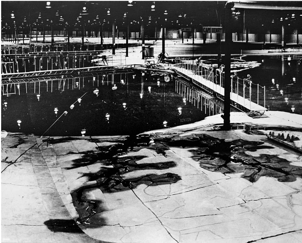
Figure 5. The sprawling Chesapeake Bay Hydraulic Model, housed in a warehouse that covered fourteen acres, became obsolete as soon as construction was finished.

While the model was being constructed, the Chesapeake Bay was going through a watershed era that would radically transform the practice of environmental management in the United States, rendering the model obsolete. In fact, the 1970s could be said to be the watershed era for the Chesapeake region, since what emerged from it was the first watershed-scale environmental management program ever implemented in the United States. Two major developments made this emergence possible: first, enactment of the Clean Water Act (CWA) in 1972 shortly after establishment of the Environmental Protection Agency (EPA) in 1970, which granted federal authority over the management of interstate water quality; 43 and, second, the development of computational modeling that allows a management organization to monitor and track water quality in complex hydrodynamic systems. 44 Together, these factors made watershed-scale management possible in a new way, and they made the hydraulic model obsolete.