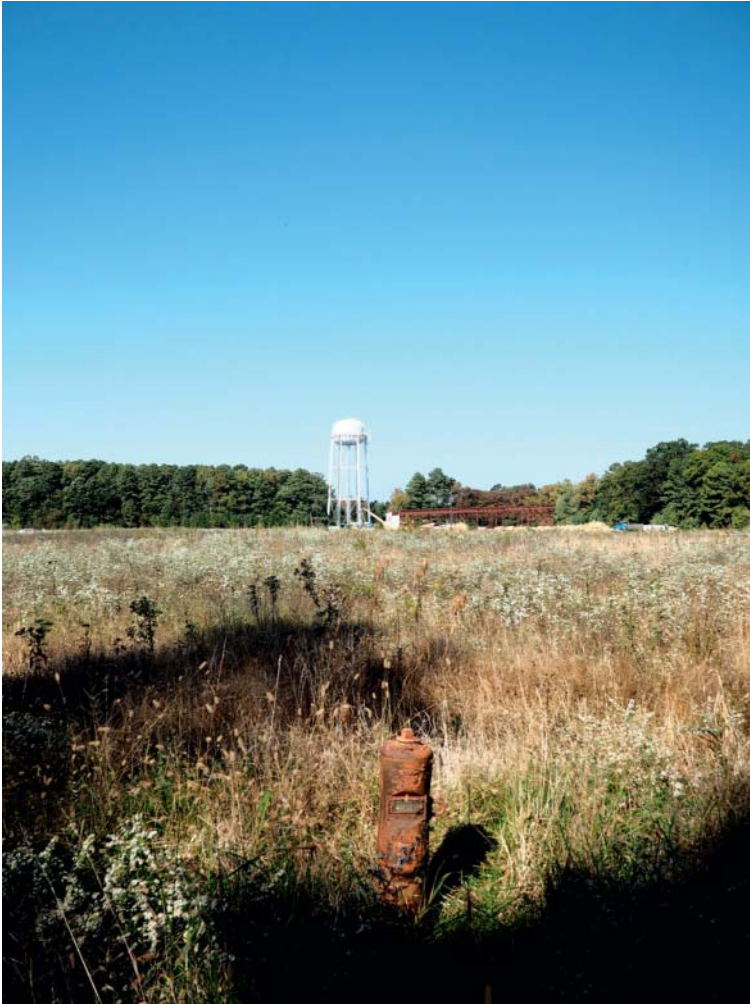
Figure 4. Former site of the Chesapeake Bay Model. An original water meter is in the foreground, and the original water tower can be seen in the distance.

cost upward of $25 million. 40 The result was a fourteen-acre structure housing the eight-acre scale model of the estuary and its tidal tributaries, complete with running water and figures of prominent sites such as the US Congressional Building (fig. 5). 41 However, by the time it was constructed, the model was already obsolete. It was brought up to full flow only a handful of times for testing (and then once more to successfully locate the missing body of a passenger on an airline that had crashed in the Potomac River near Washington, DC). 42 After that, its doors were closed and the funding was cut back; the model was left to decay for the next twenty years. Ultimately, the entire structure was demolished in 2015, after the roof caved in during a large snowstorm. The site was cleared and regraded; all that remains of this impressive piece of engineering is the field described above.