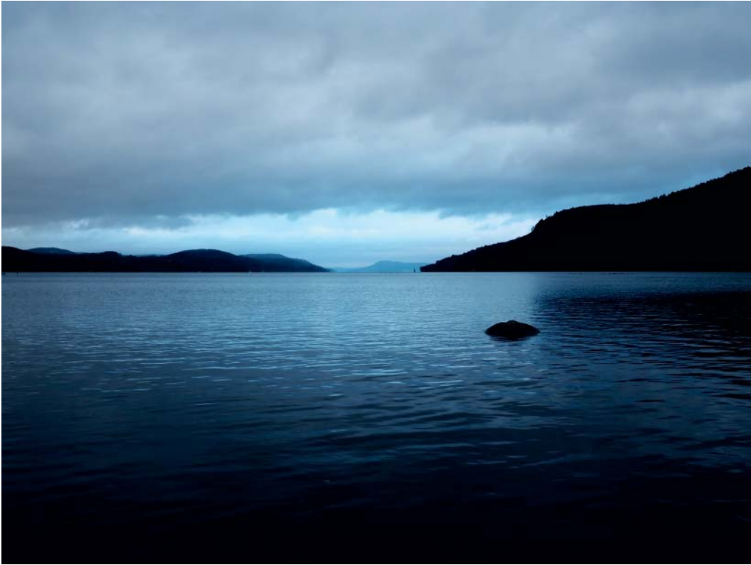
Figure 2. View of Lake Otsego from Cooperstown, NY.

Smith goes on to describe large tracts of untamed wilderness and encounters with indigenous peoples who lived off the land, including his infamous relationship with Pocahontas and Chief Powhatan. Smith's quote today often prefaces the story of the decline of the Chesapeake Bay, 21 and from there the narrative follows a typical modernist periodic motif: with the rupture of colonization, there was a dramatic decline in the ecology of the landscape resulting, ultimately, in the eutrophication of the Chesapeake Bay. 22 While it may be true that the decline of water quality in the bay can be traced back to the watershed moment of colonization, 23 the periodicity of the narrative cements the idea of a primordial wilderness outside of the realm of history—a pure and untouched landscape that must now be “restored.” By wrenching both the wilderness landscape and the region's indigenous peoples out of history, the narrative, reinforced by the spatial rupture of the colonial historic sites, justifies, obscures, and validates the ongoing and intersecting processes of ecocide and genocide that coincide with colonization (see Rose). The decline of the landscape and water quality in the Chesapeake Bay