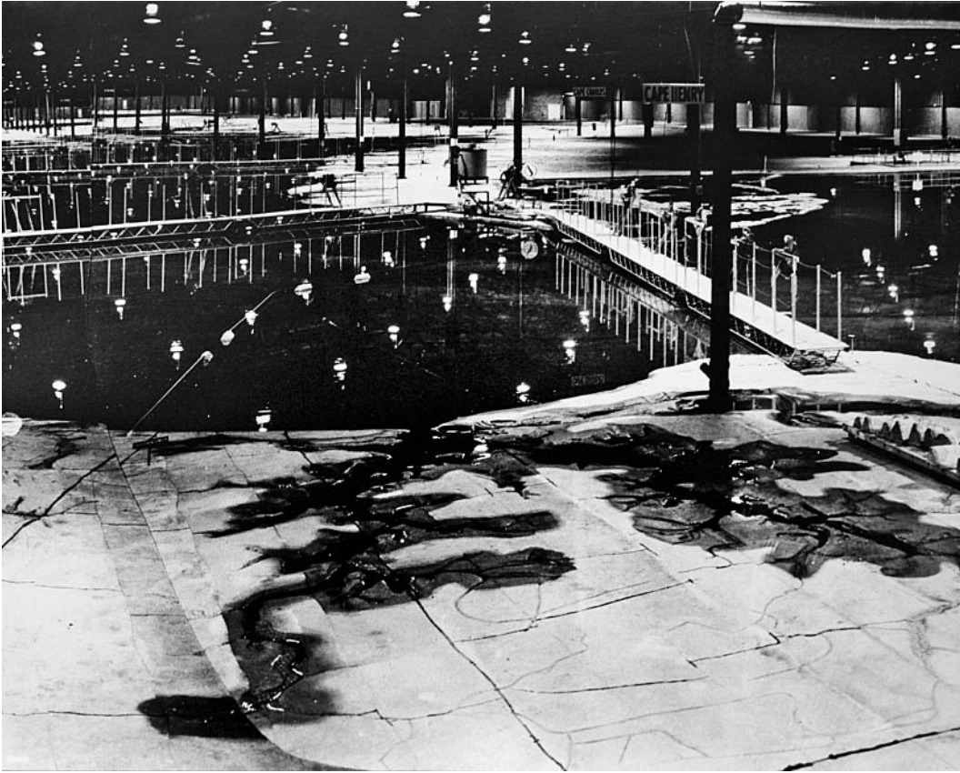
Figure 5. The sprawling Chesapeake Bay Hydraulic Model, housed in a warehouse that covered fourteen acres, became obsolete as soon as construction was finished.

While the model was being constructed, the Chesapeake Bay was going through a watershed era that would radically transform the practice of environmental management in the United States, rendering the model obsolete. In fact, the 1970s could be said to be the watershed era for the Chesapeake region, since what emerged from it was the first watershed-scale environmental management program ever implemented in the United States. Two major developments made this emergence possible: first, enactment of the Clean Water Act (CWA) in 1972 shortly after establishment of the Environmental Protection Agency (EPA) in 1970, which granted federal authority over the management of interstate water quality; 43 and, second, the development of computational modeling that allows a management organization to monitor and track water quality in complex hydrodynamic systems. 44 Together, these factors made watershed-scale management possible in a new way, and they made the hydraulic model obsolete.