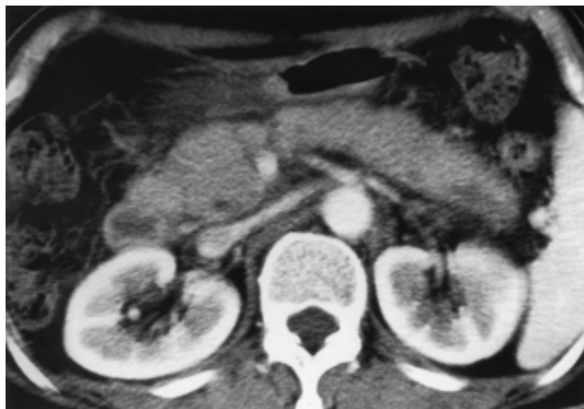
Figure 1 —CT on admission. Diffuse swelling of the pancreas can be seen.

Because autoimmune pancreatitis was strongly suggested, corticosteroid administration was initiated. Prednisolone (30 mg/day) was administered and the dose was tapered. One month after the steroid treatment was started, the swelling of the pancreas improved to normal size (Fig. 3), and the bentiromide test value improved to 71.2%. However, insulin secretion was