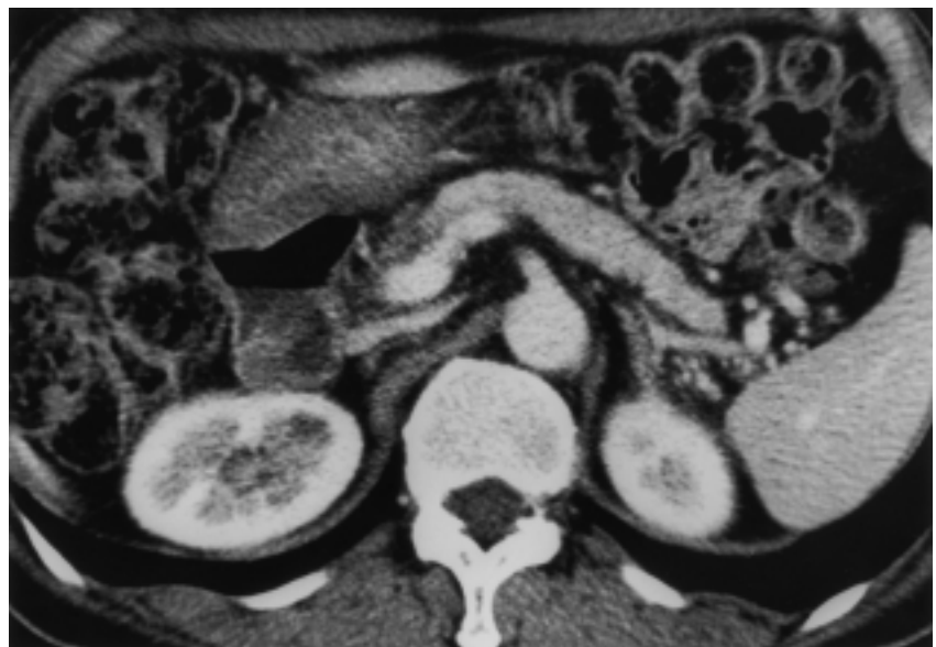
Figure 3 —CT on admission after steroid treatment. The pancreas returned to normal size.