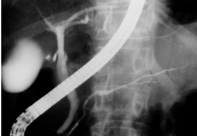
Figure 2 —Endoscopic retrograde cholangiography and pancreatography on admission. Diffuse irregular narrowing of the main pancreatic duct and mild smooth stenosis of the lower common bile duct can be seen.

not restored; the C-peptide response to a glucagon test after treatment was 0.1 ng/ml. The basal plasma glucagon level was 94 pg/ml, and the increment of plasma glucagon after intravenous infusion of 30 g arginine hydrochlorate in 30 min was 228 pg/ml, suggesting that \alpha -cell function was preserved. The patient is being treated as an outpatient with 5 mg/day prednisolone and multiple insulin injections.