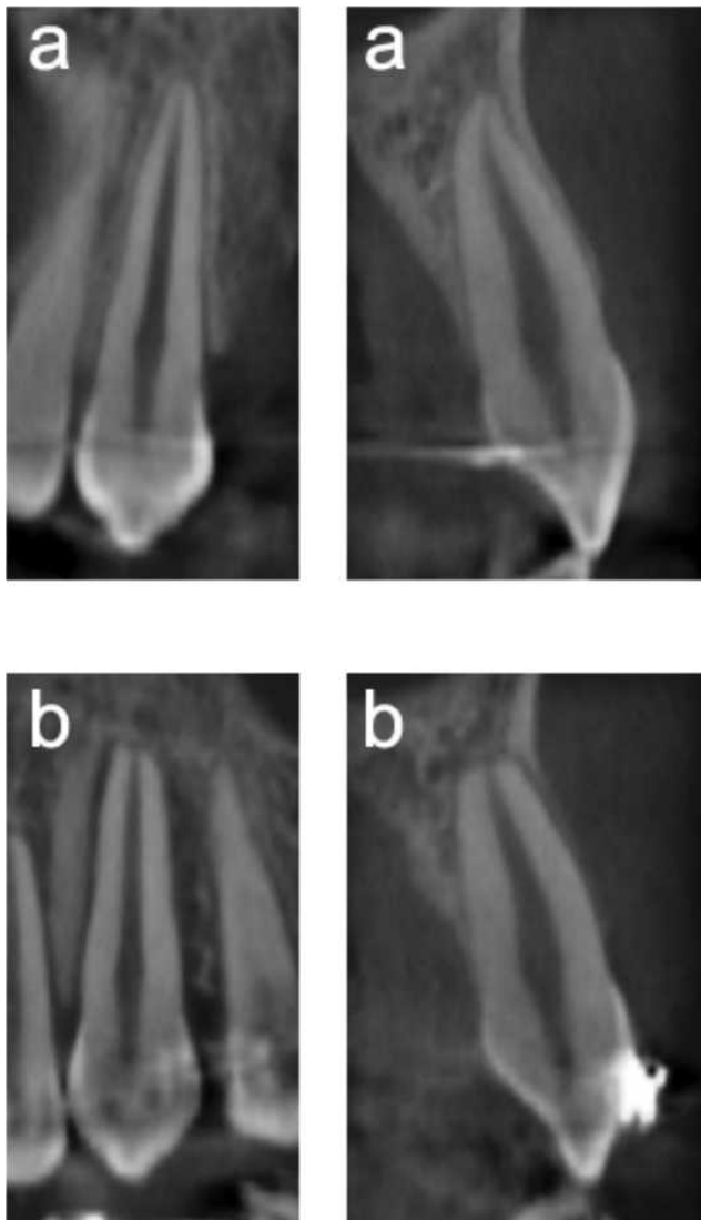
Figure 2. Reformatted CBCT images (cropped) of upper left canine in frontal and sagittal views obtained at baseline (a) and after 6 months of treatment (b). Resorption index was judged to be score 3 after the 6 months of treatment.

CBCT examination before treatment, 6 months after the start of treatment, and at the end of treatment. CBCT has a fairly low radiation dosage compared with other advanced radiographic methods, 25,26 and the amount of radiation could be considered similar to that of eight panoramic radiographs. 36