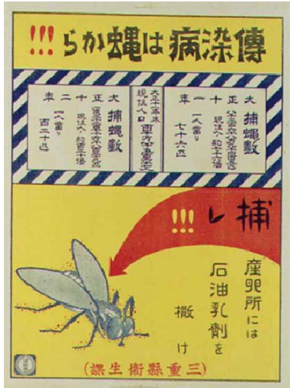
Fig. 2 Poster of “Swat the Fly Day” in Mie Prefecture in 1924.

the “metropolitan public health (都市衛生, toshi eisei),” public officials organized cleanliness drives toward maintaining good health in cities.