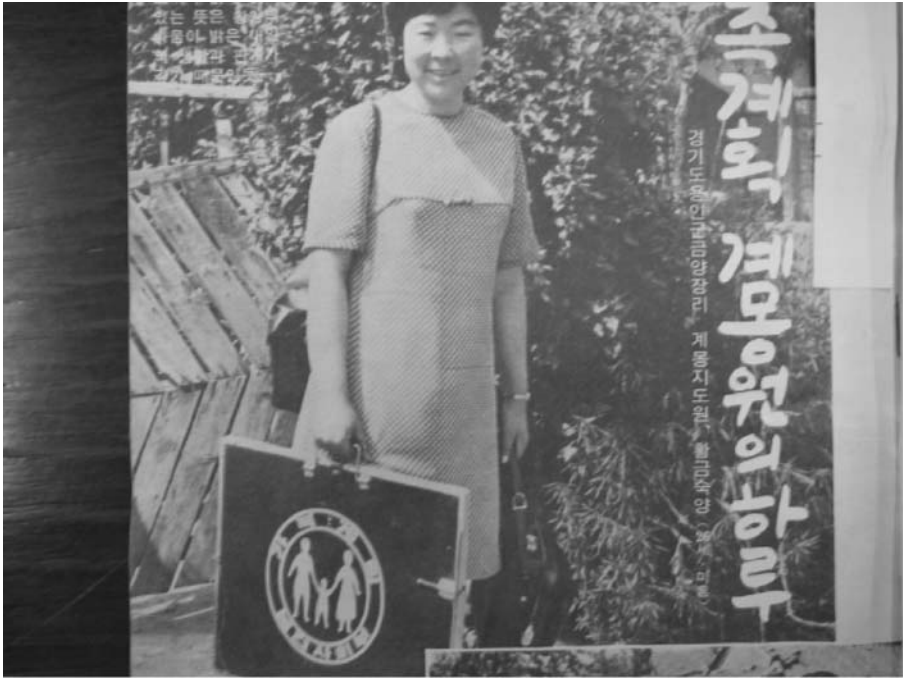
Fig. 5 This image of a Family Planning worker, taken from an early 1970s edition of “Happy Home,” captures the representative type that FP was looking for, a modern woman willing to share her knowledge and experience with other village residents (가정의 벗)

the practice of birth control, regardless of the method recommended. If FP furnished a “modern” alternative that would permit control over family size, there was still a significant portion of South Korean society that did not yet wish to participate.