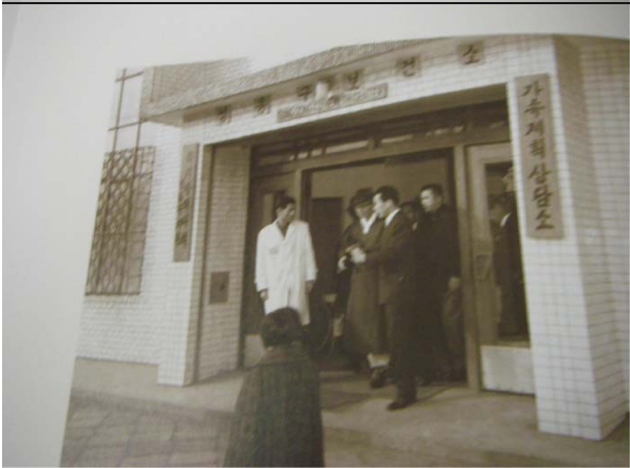
Fig. 2 The Sundong-gu public health center, created in 1964 to address the problems of living conditions in urban Seoul ( Seoul through Pictures 4: Seoul, To Rise Again (1961–1979) )

Contrary to expectations, the embrace of new birth control technologies in South Korea would turn out to be most enthusiastic among rural women, those seeking to gain a measure of control over their lives. For this very reason, the Koyang study (Fig. 3), which began in the fall of 1963, would ultimately become more important than the coterminous Sundong-gu study (1964–1966). The Koyang study sought to establish a basis for comparing a region of southwestern Seoul (near today’s Kimpo airport) with an equivalent rural community located 13 miles north of the city (Bang et al. 1963b). Ultimately, the Koyang study, with its emphasis on examining the dominant forms of communication in rural areas, was well-suited to carrying the national effort to the rest of the country during the remainder of the decade.