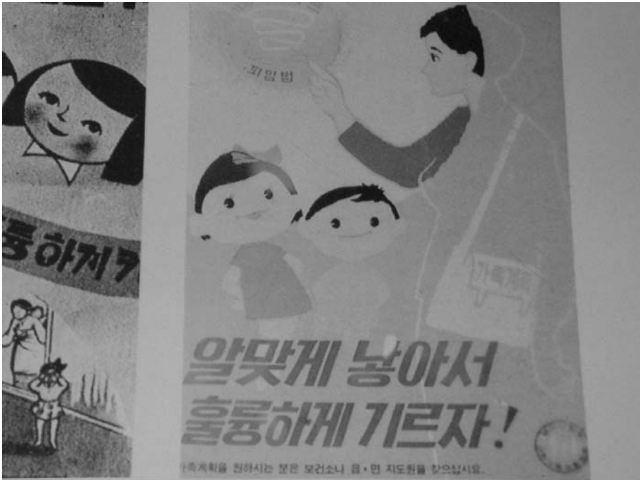
Fig. 1 By 1968, the elements of a nation-wide Family Planning (FP) program were in place in South Korea. A famous 1965 poster issued by the Planned Parenthood Federation of Korea (PPFK), this image, urges South Korean families to “have the proper number of children and raise them well!” (The woman featured in the poster, a Family Planning representative, is pointing to the Lippes Loop, which was first widely distributed in South Korea in 1964. Planned Parenthood Federation of Korea, PPKF 10-Year History , Seoul: PPFK, 1976.)

Center (PSC) became in effect, advocates of change in rural areas, carrying out their consulting work in many parts of the developing world, including Taiwan and South Korea (Freedman 1998). In fact, the former case, with the government starting up a vigorous experimental campaign at Taichung in 1963, would become a celebrated model, with neighboring countries sending observers on a frequent basis. As in South Korea, a rapid decline in the birth rate would soon be associated with economic growth, although there was no demonstrable causal relationship between these two factors. 10