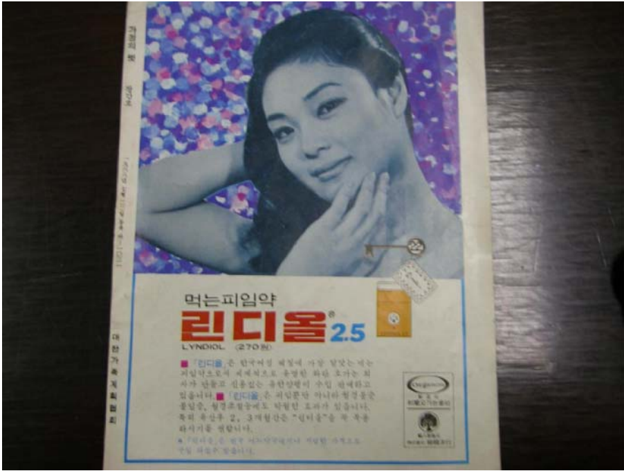
Fig. 4 This advertisement for oral contraceptives first appeared in an early 1970s edition of 가정의 벗 (“Happy Home”), a PPFK publication which began distribution in 1968 along with the introduction of Mothers’ Clubs

physical problems associated with use of the loop including internal bleeding, spontaneous rejection of the loop, infection, and extreme physical discomfort. 33 Although a certain percentage of rejection had been anticipated in the planning stages, the South Korean FP program was not prepared for the extent to which this development would affect their targets. Moreover, the mobile van approach, while it increased access to the distribution network, did not make sufficient provision for follow-up care, meaning that rural women who experienced symptoms such as those described above were often left with no choice but to endure further pain, discomfort, and risk of serious infection. In effect, the “acceptors,” once enrolled in the system, took on far greater significance as statistics than as individuals.