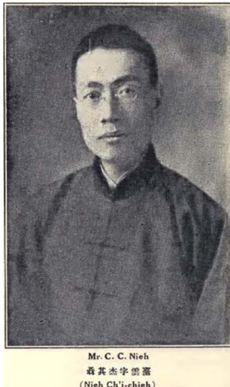
Fig. 3 Nie Yuntai 聶雲台 (1880–1953). A liberal entrepreneur and a tycoon in China’s modern textile industry

In light of this difference in the appreciation of material factors, a fascinating new standpoint was expressed in an article with the provocative title “Repudiating the Doctrine of Hygiene” ( Tuifan weisheng xueshuo ). Its author, Nie Yuntai (1880–1953, Fig. 3), was a tycoon in China’s modern textile industry and the grandson of Zeng Guofan 曾國藩 (1811–1972), an eminent Chinese official and Confucian scholar who helped suppress the devastating Taiping Rebellion (1850–1864). Nie was among a handful of new-style entrepreneurs; he had held the position of factory director in China’s largest private cotton mill (Hengfeng Cotton Mill) and, in 1920, become president of the Shanghai General Chamber of Commerce, the largest modern business association in China. Mr. Nie never left the country to study abroad, but because his father had long been employed at the Jiangnan Arsenal, he had been able to study English with the wife of John Fryer, had taught himself mechanics under the guidance of the foreign engineers at the arsenal, and even