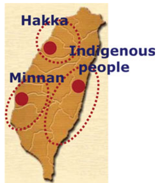
Fig. 3 The three areas from which blood samples from the “four great ethnic groups” will be drawn.

Due to a faulty understanding of ethnicity, the Taiwan Bio-Bank has essential problems it has to clear up. My analysis shows how the categories that defined