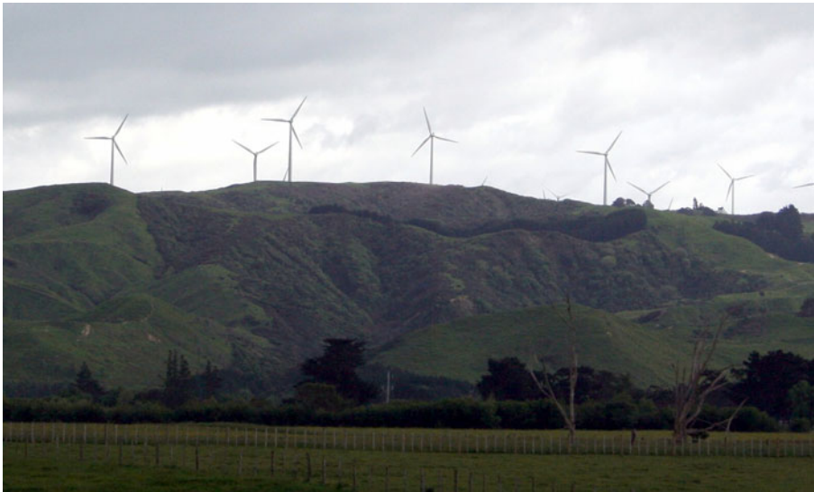
Fig. 1 Visual impact of the Palmerston North wind farm on the scenic vista, taken by the author while on holidays in Aotearoa, New Zealand; December 2008

development, which aligned to the UK position (Hindmarsh and Matthews 2008). The minister subsequently proposed a National Code on Windfarms to actively involve local communities in project implementation (Australian Government 2006). Supported by local government, the renewable and wind energy industries, planners and community interests, a federal government-led roundtable began to develop national guidelines. State governments, however, did not participate in rejecting a participatory national code as posing too much red tape for development. State governments also claimed existing public engagement was sufficient. But in following the limited public involvement mode that claim was contradicted by the rise of intense and consistent local contestation, with the new social movement of landscape guardian groups in the vanguard. By 2007, for every second wind farm proposal, a landscape guardian group had emerged to contest it (with 42 wind farms constructed by 2007; Hindmarsh and Matthews 2008: 218). In late November 2007, a looming federal election stalled the roundtable's deliberations.