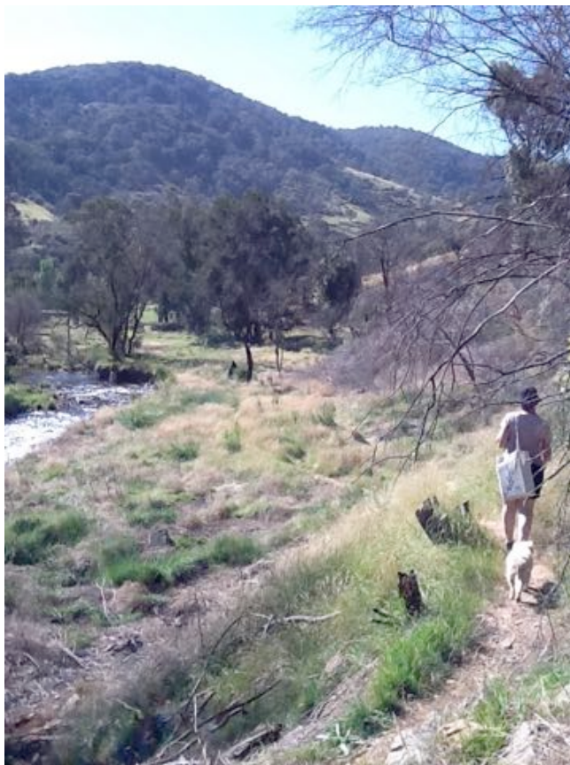
Figures 7 and 8. Walking the tracks beside Micalong Creek.