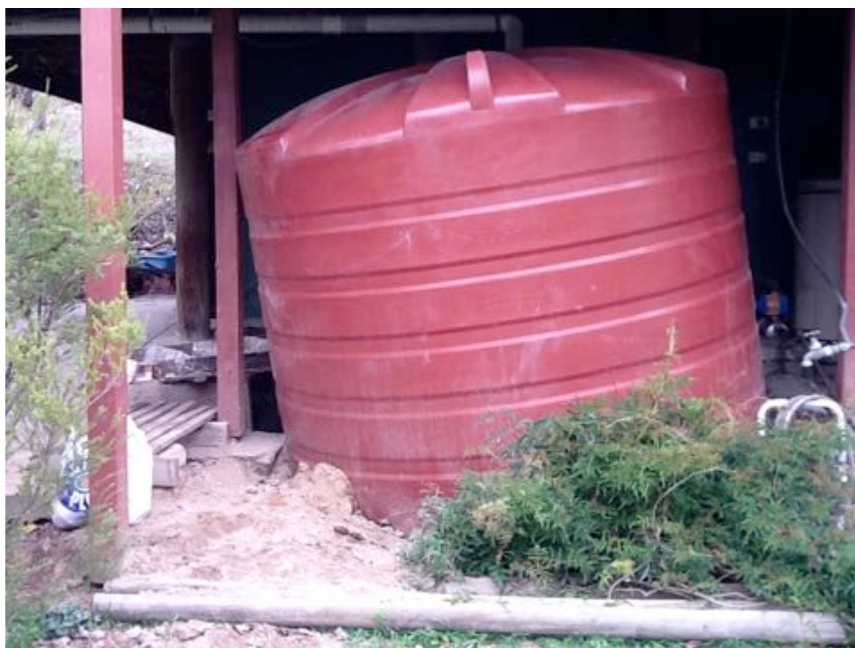
Figure 6. Wombat burrow under the water tank at Micalong Creek.

At first she was quite enchanted by the idea of cohabiting at such close quarters with a wombat, and she didn't really expect it to stay. That was over four years ago now. She's grown accustomed to its gruntings and scrapings and bumpings in the night, and assumedly the wombat's not too phased by living with her smells and noises either. It ignores her small dog's efforts to bail it up and watches as the dog retreats to the safety of the verandah. Wombats love to dig, always renovating and extending their subterranean homes. So the holes under her house just keep getting bigger and bigger. Last week she arrived to find the wombat had undermined her new water tank, upending it and pressing it hard against one of the structural posts. She had to completely empty it to prevent further damage. Precious water lost. This is what the farmers mean by "dangerous trouble makers." "I'd shoot it if it was under my house" her neighbour tells her. She ponders the space of shared contact of burrow, house, human and wombat. She could take action to evict it, but can't. Wombats have an inheritance too. This Ngunnawal country is also wombat country. It has been for millennia.