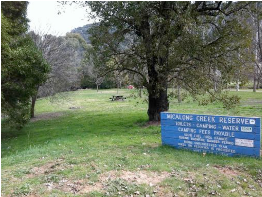
Figure 2. Micalong Creek Conservation Reserve.

unpacks the car, careful not to tread in the piles of wombat poo. A sparrow catches her eye and she wonders what to make of the mess of inheritance.