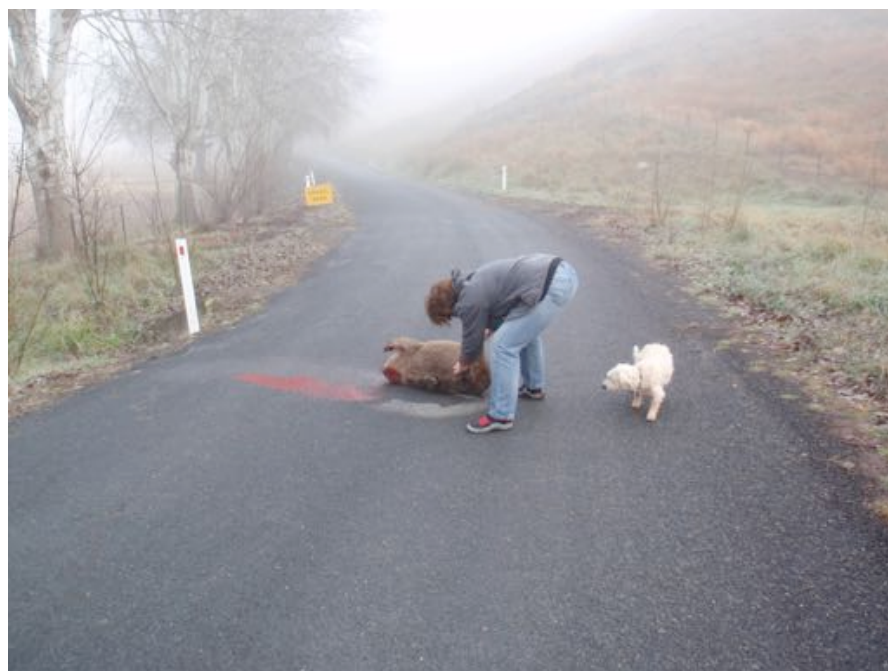
Figure 9. Dead wombat on the road to Wee Jasper.

Yet another grisly early morning discovery. It's a regular event. Because the blood's so red on the road, she wonders how long it's been since the wombat was run over. Her dog sniffs the body then backs off. It's very stiff. After dragging the dead wombat off the road, she girds herself and checks to see if there's a live joey. She can feel a lump. She's too squeamish to put her hand right inside the pouch, so she squeezes the joey to the entrance by pressing on the mother's abdomen. It's coming out. She can see and feel it now. It's hairless, still and cold. It must have frozen overnight. She returns to the car, feeling disappointed and relieved, shaky and sad. Her dog sniffs her hands.