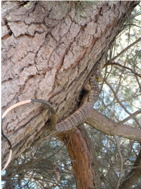
Figure 3. Goanna up the tree at Micalong Creek.

The summer is extremely hot—climate change is biting, people say. She refrains from swimming in the creek as the water snakes have given her a fright, and instead she follows her dogs and sits under the dense shade of a fir tree. There’s a goanna half way up the tree, and king parrots take up the lower branches. All sit quietly enveloped by the heat. A sort of “we” opens up. 12 Will the Anthropocene draw us together or wrench us apart she wonders?