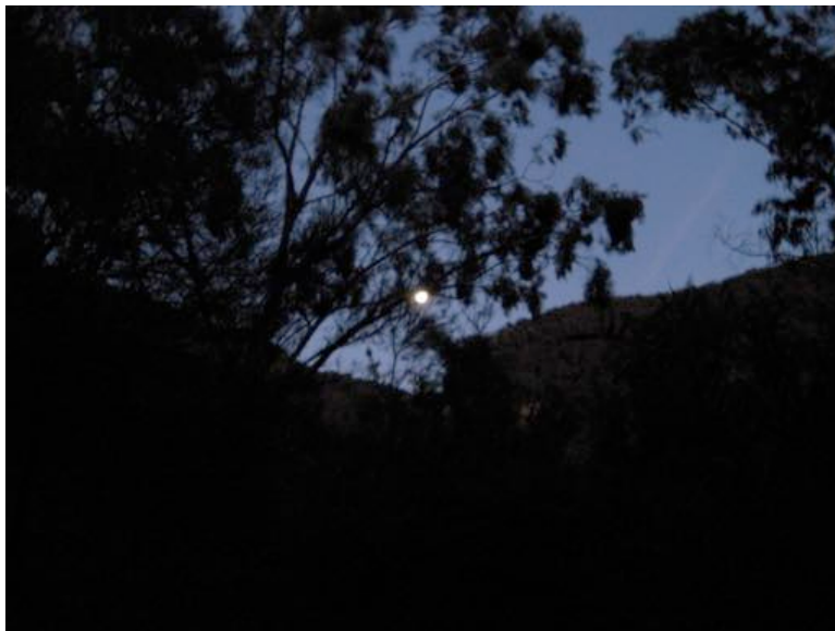
Figure 4. Dark night in Micalong Creek.