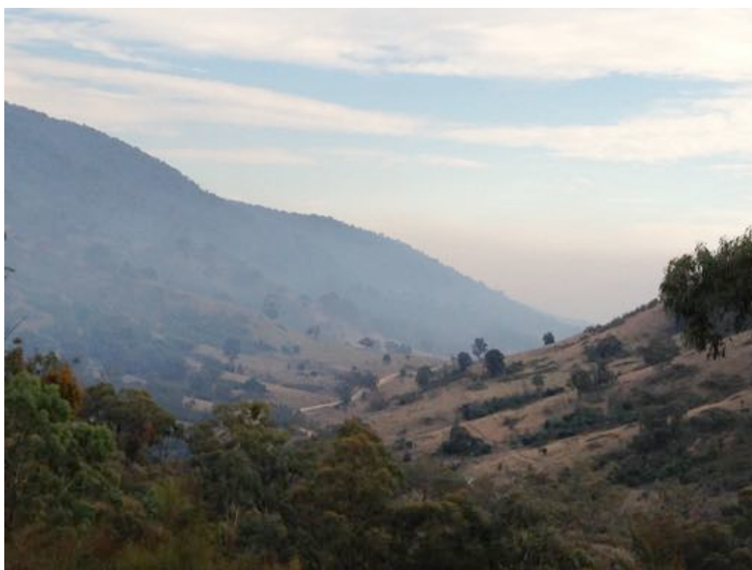
Figure 1. Wee Jasper Valley.

She drives down the valley past the paddocks and fences, sheep and cattle, past the 1080 poison signs warning of baiting for dingoes and wild dogs, and the kangaroo and wombat road kill. She is on her way to her home in the conservation reserve at the end of the valley. Her exhaust gases mix with a soft breeze carrying smells of gums and manure. At her place she lets the dogs out of the car and they rush off to harass the water dragons along the creek. As she enters her house she's greeted by the kookaburra and magpies who frequent her verandah. She