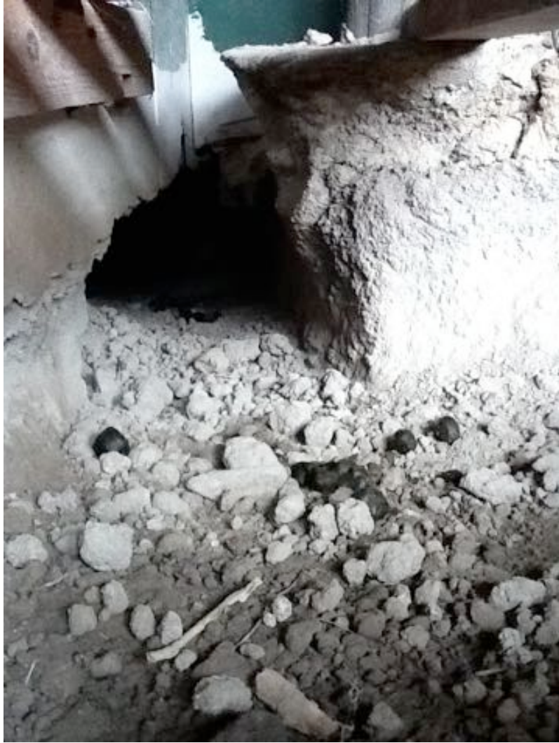
Figure 5. Wombat burrow under the house at Micalong Creek.

It was after an unusually wet spring that the wombat set up residence under her house. The ranger's theory was that its creek-side burrow was probably washed away in last year's record-breaking flood. The wombat has no truck with the violence of property, with its gridded landscape and no trespassing signs. It moves to a different pattern and finding nice dry soil under her house, starts to dig. Urged on by the traces of colonialism resonant in the earth, paws move faster, burrows expand and foundations quiver. She catches a slight movement in the soles of her feet and feels the precariousness of other creatures, like herself, whose belonging in this place is not assured.