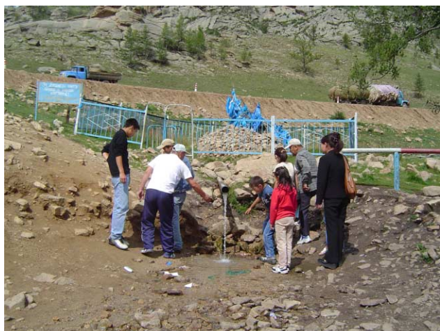
Figure 1 | Spring with protection and upgrade, 'Gants modnii' spring, Arkhangai aimag, 2004.08.05.