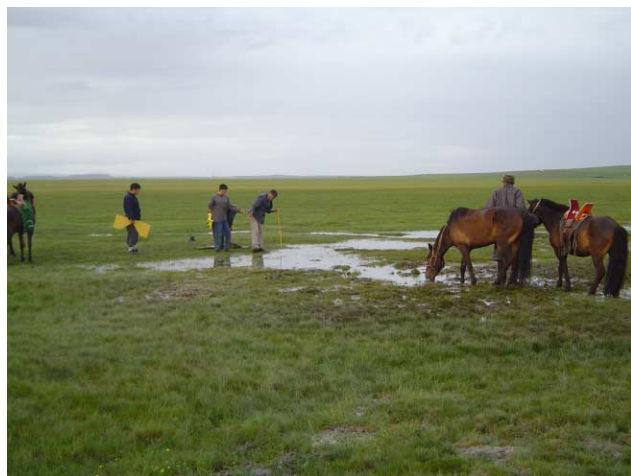
Figure 2 | Spring without protection and upgrade, 'Shine' spring, Tuv aimag, 2004.07.02.