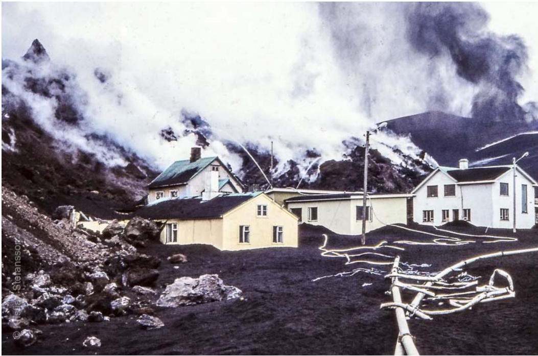
Figure 3. Cooling of lava, Westman Islands, 1973.

mainly the responsibility of Jónsson. After weeks of intensive pumping and the movement of pipes and people back and forth, the lava flowed eastward, away from the harbor and into the ocean. According to the United States Geological Survey, this was “the greatest effort ever attempted to control lava flows during the course of an eruption.” 39 Eventually, the volcano cooled down. On July 2, Sigurgeirsson descended into the crater and declared the eruption “over,” sending the local team into jubilation. It was time for Westman Islanders to move back and resettle.