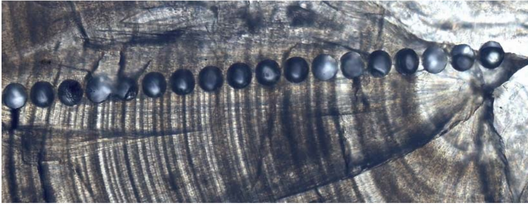
Figure 4. An otolith cross-section that has been placed under magnification. The holes mark where samples for isotope analysis have been extracted with a laser ablation multi-collector inductively coupled plasma mass spectrometer.

vary depending on the water through which a fish swam. Not only does saltwater have different trace minerals from freshwater, but different streams, and even different parts of the same stream, have different mineral contents depending on the types of rocks over which they flow. 51