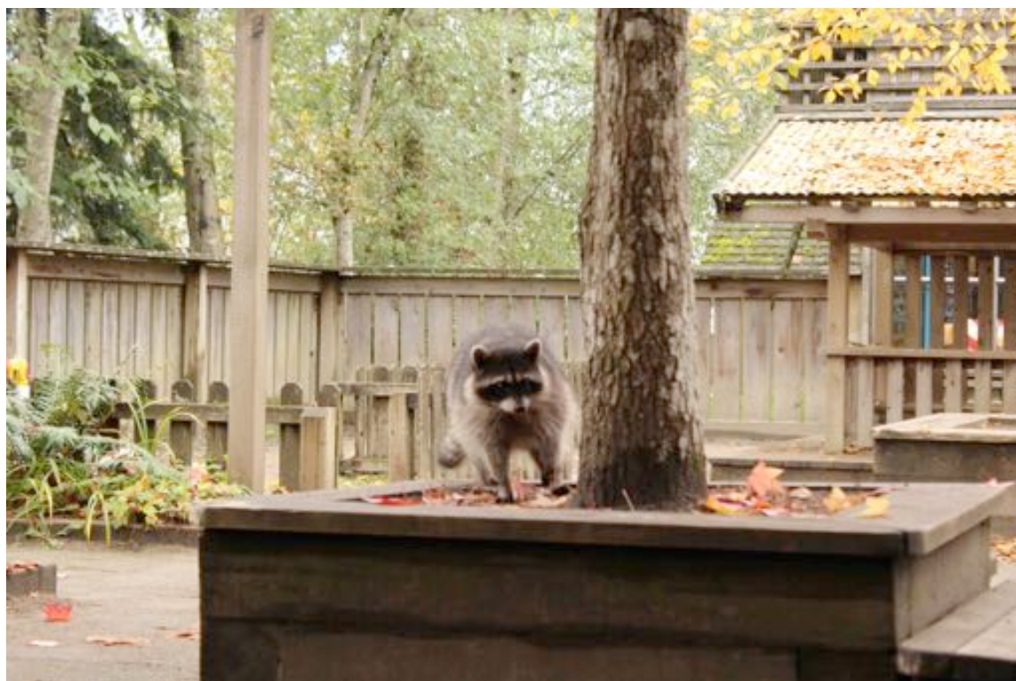
Figure 3. Raccoon in the playground.

In this childcare centre complex, educators feel ambivalent about the presence of the raccoons, and especially about the raccoons' insistence on crossing boundaries. The educators juggle their desire to develop the children's attachment to the raccoons with their duty of care to protect the children from the possible risks that exist when co-habiting with these animals. Mandated by British Columbia child care licensing regulations, they conduct regular playground inspections (including raccoon checks) to identify 'hazards' and 'non-conformances' against the playground standards. If necessary, they make adjustments to meet the mandatory requirements and provide a 'safe,' 'secure' environment for the children.