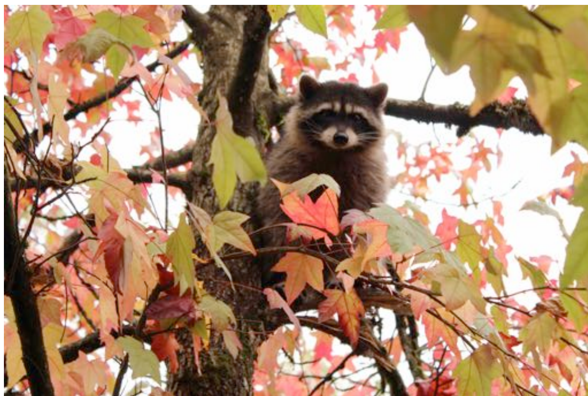
Figure 2. Raccoon in playground tree.

A third way raccoons cross the human/nonhuman divide is microbially, by infecting. As pests and “trash animals,” 35 raccoons are perceived as infectious to humans (especially children) and their pets. Educators at the childcare complex have been advised, by both parents and childcare licensing officers, that not only are raccoons susceptible to carrying rabies, but their feces are infectious: humans might contract leptospirosis or salmonella by touching, digesting, or inhaling raccoon feces. The educators are particularly worried about raccoon worm. The raccoon is the primary host of an infectious worm known as Baylisascaris procyonis . 36 These worms develop in the raccoon intestine, producing millions of eggs that are passed in the animal’s feces. The eggs become infectious after a two to four-week incubation period, after which they can survive in the environment for several years. Humans are infected if they ingest fertile eggs—and, because dominant developmental discourses maintain that children frequently put objects, hands, and dirt into their mouths, children are seen to be particularly at risk of infection.