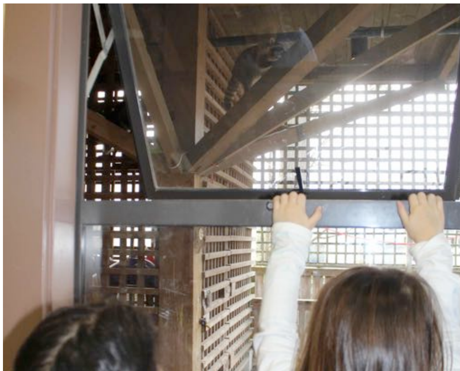
Figure 1. Children watch the raccoons through the window.

The children's and educators' curiosity about the raccoons is tinged with disconcertment. Humans in the childcare centres are taken aback by the raccoons' similarities to them. Recognizing themselves in these racoons, they are attracted to them. This process is akin to what Levinas calls an 'ethics of recognition,' where we see ourselves in the face of the other. 27 However, the educators are threatened by the raccoons' bold wild-nature / domesticated-urban boundary-blurring behaviours. Even more provoking for humans is raccoons' 'naughtiness;' they are tricksters and jokers who sabotage carefully planted garden boxes, vandalize trash cans, rearrange the playground, tap on the classroom skylights, and play with the children's toys. These raccoons defy authority, resist human plans, ignore divides, and deviate from the expected path. In other words, they live up to their reputation as 'masked bandits' full of mischief.