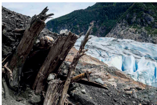
Figure 2. Students learn how scientists combine living and dead trees to create millennial-length records of temperature, such as the buried forests emerging here from the wasting margin of Mendenhall Glacier.

various stakeholders have siphoned the water from the river to serve seven western states' needs. Then they collect data concerning where the water comes from, who is using the water and how much they are using, and what the future may hold for the people living in the basin. In the final part of the lab, students virtually explore three tree-ring sites within the basin and work in groups to measure pre-marked cores. They produce a graph of the raw data and are asked to compare their measurements to a published millennial-length stream-flow reconstruction of the Colorado River (Woodhouse and Lukas 2006; Meko et al. 2007) and compare narrow rings in their sample and measurements to the same years in the reconstruction. In this lab, students are also introduced to basic tree-ring principles, such as locally absent rings, false rings, and age trends. Additionally, they are asked to think about how a millennial-length tree-ring reconstruction can add context to our understanding of stream-flow, as well as how these records of climate and hydrology can support evidence-informed decision making.