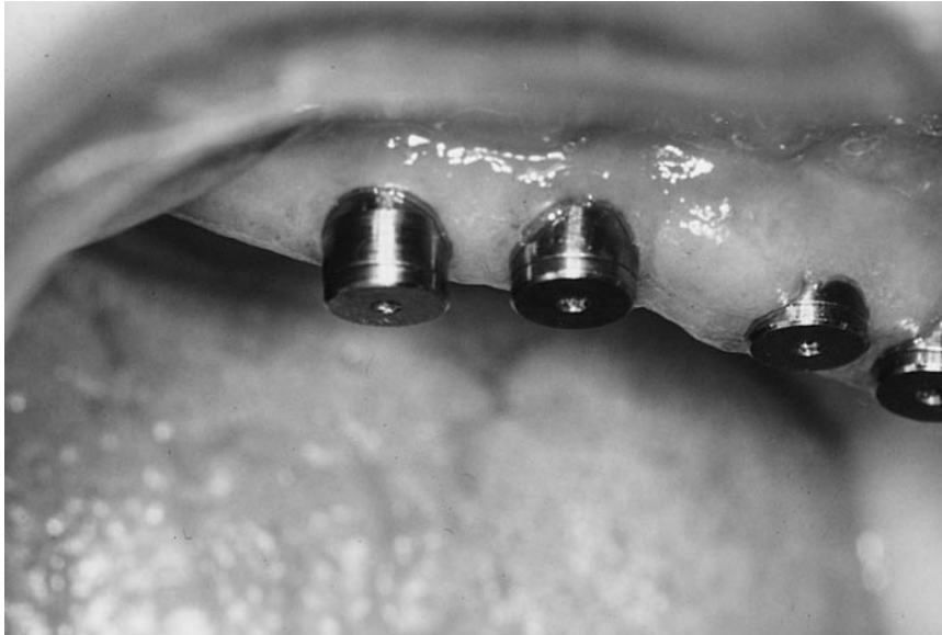
FIGURE 7. Lateral view of the keeper.

combination with magnetic attachments, good results were reported in the literature. Walmsley et al 8 reported a 100% success rate (63/63) after placement of magnets with an average follow-up period of approximately 3 years. Additionally, as indicated in that article, use of longer implants, at least 10 mm, is recommended to expect predictability in the long term.