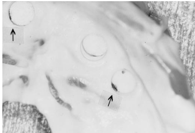
FIGURE 3. Interferences (arrows) have to be ground repeatedly until they are completely eliminated.

Although abutments were selected so that they would protrude 0.5–1.0 mm supragingivally, the most distal abutment on the right side protruded about 2 mm supragingivally because the implant had not been placed deep enough (Fig 7). Therefore, the part of the denture corresponding to this side of the abutment was relieved in order to alleviate excessive lateral stresses. After completion of the denture, magnets were placed on the keepers, and they were incorporated into the denture under occlusal pressure.