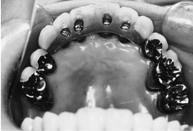
FIGURE 5. Occlusal view of previous prostheses before extraction of teeth.