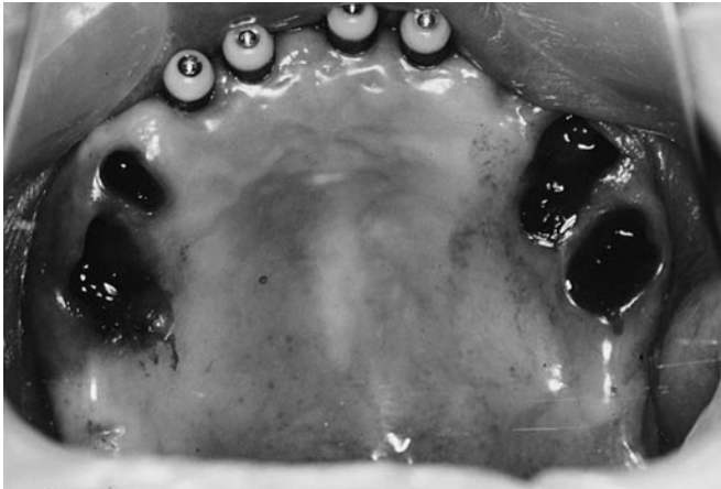
FIGURE 6. Occlusal view after extraction of teeth.