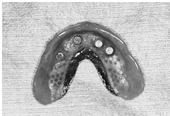
FIGURE 4. Unpolished surface of a maxillary overdenture showing four magnets embedded in the acrylic resin base.