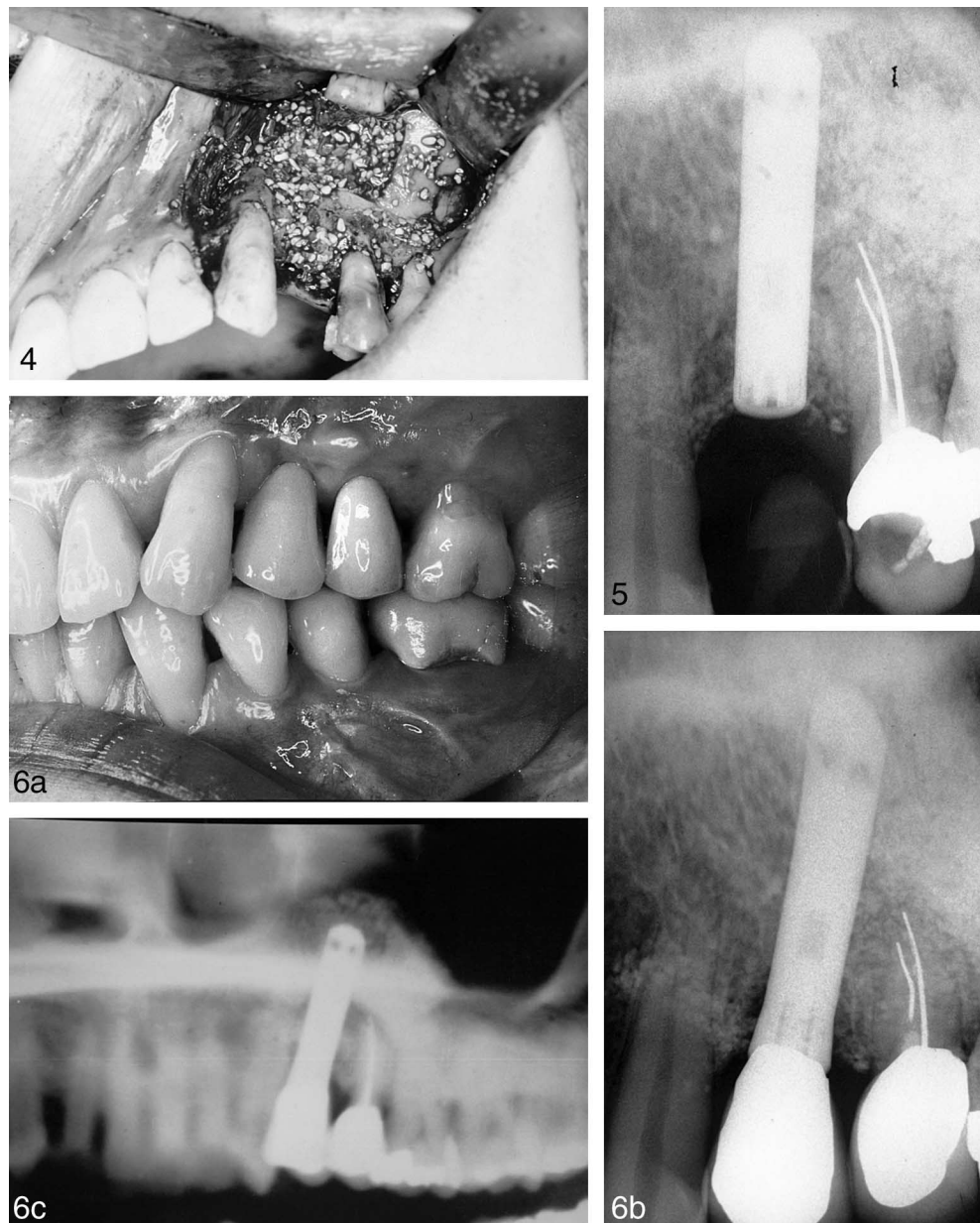
FIGURES 4–6. FIGURE 4. Grafting materials packed around the implant fill up remaining spaces of the sinus and are stabilized by autologous fibrin adhesive. FIGURE 5. Periapical radiograph at second-stage surgery. FIGURE 6. Three-year postoperative results: (a) clinical condition; (b) periapical radiograph; (c) panoramic radiograph showing elevation of the sinus.

of the amount and position of the attached gingivae. Additional vertical relieving incisions were made in the buccal vestibule to facilitate the reflection of the full mucoperiosteal flap. A full thickness flap was then reflected from the underlying bone. Once the lateral maxillary wall was exposed, a square window was prepared. A round diamond bur was used at slow speed in a