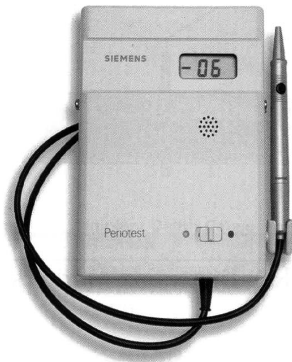
FIGURE 1. Periotest instrument for measuring implant stability. The plunger rod within the handpiece is electromagnetically accelerated; when it strikes a firm object, the plunger rebounds into the handpiece. The time that the plunger remains in contact with the object is returned to the Periotest, and the central processing unit converts this time into a Periotest Value (PTV). PTV calibration ranges from -8 to +50 PTVs. The more rigid the object, the more negative the PTVs, and flexible objects provide more positive values. Range for integrated implants is -5 to -2 PTVs. Between -2 and +2 , implant may appear clinically stable but suggests a marginal bone-implant complex.

measurements may well be equally important in monitoring the status of the bone-implant complex to identify early signs of problems. Such information would also contribute to a better understanding of bone response to dental implants after uncovering. If early signs of problems within this complex could be measured, they would permit early intervention and research to develop new and innovative corrective treatments.