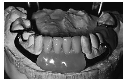
FIGURE 1. Labial bar mandibular removable partial denture with anterior saddle.

The labial bar connects the saddles on the left and right sides of a partial denture and can also include an anterior saddle (Figure 1). Like a conventional