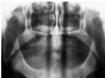
FIGURE 1. Fully edentulous upper and lower arches.