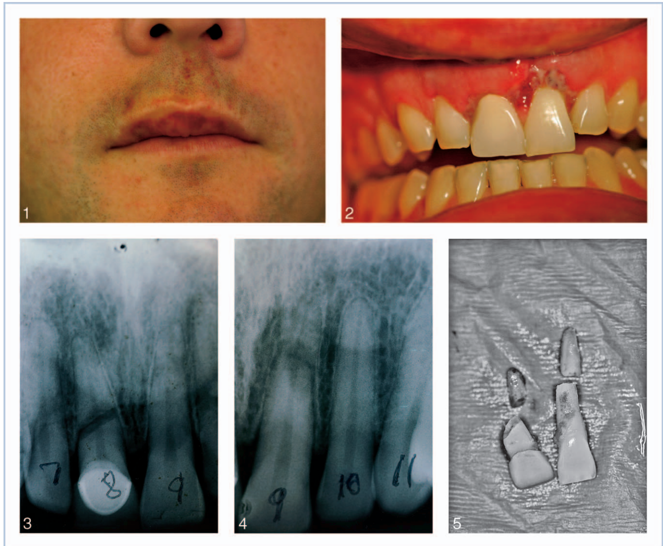
FIGURES 1-5. During an assault, a 35-year-old man sustained blunt trauma to soft tissue of the upper lip, nose, and premaxilla. Periapical radiographs of two upper central incisors show root fractures: No. 8, mid root fracture; No. 9, apical third root fracture. The alveolar process was intact. Teeth and fractured root fragments were removed atraumatically in anticipation of delayed implant placement.

The healing process following extraction of the tooth (nontraumatic origin) or avulsion of the tooth (traumatic origin) often leads to varying degrees of alveolar ridge atrophy. The progression of healing after a tooth extraction goes through certain resorptive stages of fibrin clot organization (first 4 weeks), immature (woven) bone formation (4–8 weeks), mature (lamellar) bone development (8–12 weeks), and bone stabilization stage (12–16 weeks or about 4 months). 16–18 Postextraction bone resorption is always three-dimensional, with the greatest loss of bone in the bucco-palatal or horizontal direction (the width) and occurring mainly on the buccal side of the alveolar ridge. 18 Schropp et al 19 reported that two-