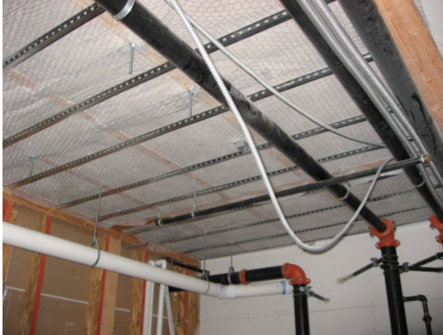
Actual Installation in Mercy Housing Idaho