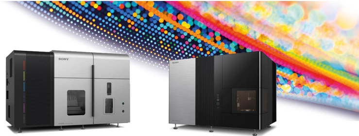
FP7000 Spectral Cell Sorter