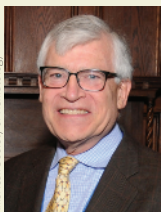
American Society of Hematology