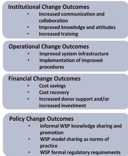
Figure 2 | Water safety plan conceptual framework outcomes.

The proposed indicators are presented in bold lettering and explained in terms of the relevant outcomes they will measure.