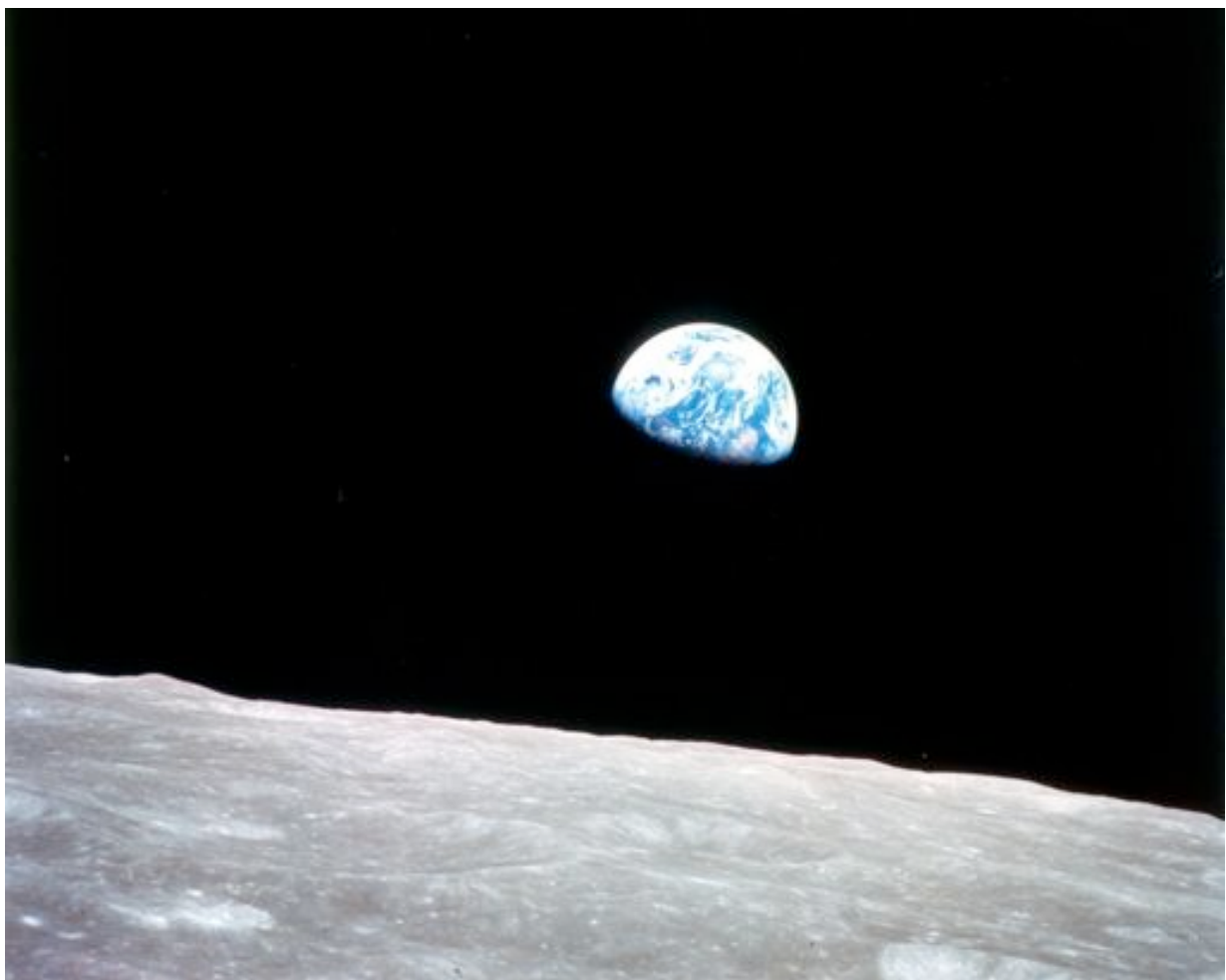
Figure 3 “Earthrise” Note that the original image was tilted in publication to this familiar landscape mode, with a lifeless moon replacing the familiar foreground of earthbound horizons.

“For the ten thousand years that constitute human civilization, we’ve existed in the sweetest of sweet spots,” writes McKibben. “The temperature has barely budged; globally averaged, it’s swung between 58 and 60 degrees Fahrenheit. That’s warm enough that the ice sheets retreated from the centers of our continents so we could grow grain, but cold enough that mountain glaciers provided drinking and irrigation water to those plains and valleys year-round ... We have built our great cities next to seas that have remained tame and level or at altitudes high enough that disease bearing mosquitoes could not overwinter.” 2 We got our first “real” glimpse of that “stable, secure, place,” he notes, in December 1968, when the Apollo 8 mission returned with the equally iconic Earthrise image of our planet as half-cloaked shadow. For astronaut Jim Lovell, the earth appeared as a “grand oasis” of terrestrial life floating in a black, sepulchral universe—an eerie and wonderful manifestation of what Kenneth Boulding had famously termed already in 1966 the “Spaceship Earth.” 3