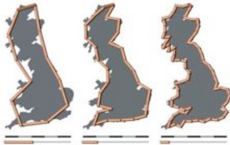
Figure 5 “The Coastline Paradox.” This image from Mandelbrot’s 1967 paper models the coastline paradox: the property that the measured length of a stretch of a deeply indented coastline like Great Britain’s depends on the scale of measurement. Smaller scales reveal new details, down to the ever-shifting grains of sand, ad infinitum .

philosophical, and scientific contemplation about deeper forms of order in nature and society. Fractals emerge in the mapping of chaotic systems due to topological folding—that is, two points can end up close to one another or far apart because of the stretching, pulling, twisting, or bending of multi-dimensional phase space, akin to a blob of food dye being stretched and refolded into a piece of bread dough until it consists of many layers of blue and white. 105 Discovered by the MIT professor Benoit Mandelbrot in the 1960s, fractal topographies—coming from the Latin fractus , or broken or uneven—connote topological dimensions that fall between two integers, producing recursive self-similarity and complexity at every scale. In Mandelbrot’s most famous example, the coastline of Britain, he explores a central paradox: the measured length of a stretch of coastline depends on the scale of measurement.