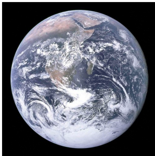
Figure 2 "The Blue Marble" (NASA, photo in the public domain).