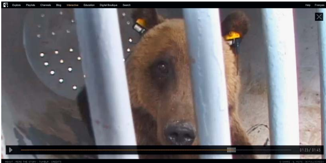
Figure 1. Bear 71 peers out of a cage before being released into Banff National Park with her new radio collar. Bear 71 ©2012 National Film Board of Canada. All rights reserved.

with the bear's capture, the film suggests that bears are thus interpellated into a system of wildlife management that forces them to give signs—to speak and communicate—of their existence to humans. Bear 71 notes that the radio collar thereafter is “constantly beeping my location to some ranger playing God.” Bear 71 's creators explain that after her collaring, “She lived her life under near-constant surveillance. . . . She was tracked and logged as data” (fig. 1). Wildlife conservation officers “tracked and logged” data about Bear 71 in order to gather information about the endangered grizzly bear population; the anthropomorphized narrative of Bear 71 reassembles the data into an invitation for viewers to listen to the singular experiences of the bear. Christine Biermann and Becky Mansfield argue: “Managing individual nonhuman lives is meaningless in responding to the crisis of biodiversity loss; individual lives acquire meaning only when they advance the long term well-being of the broader population.” 6 Bear 71 's autoethnographical narrative reframes wildlife conservation data into an affective mode of communication and address from the individual animal that gestures beyond the biopolitical tendency of species conservation.