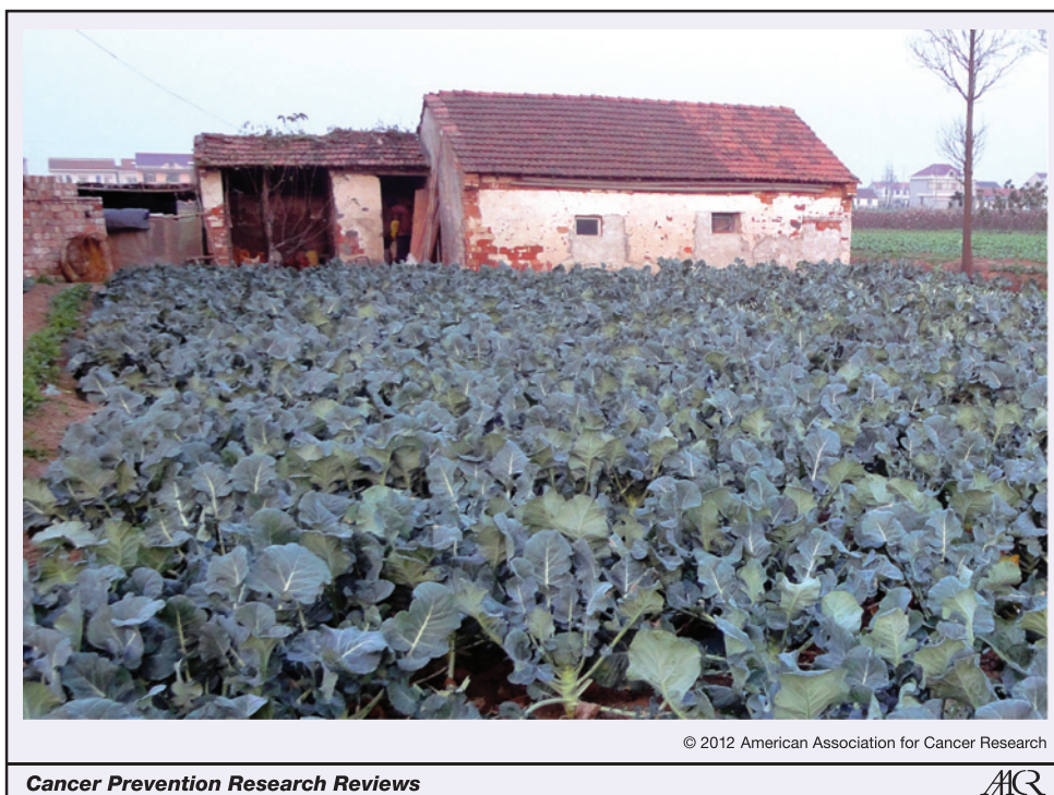
Figure 2. Jiang Lou, Qidong, China—December 2011. In the last half decade, broccoli has become the major late-season crop in eastern Qidong. Although largely produced for export, the vegetable is beginning to penetrate local markets.