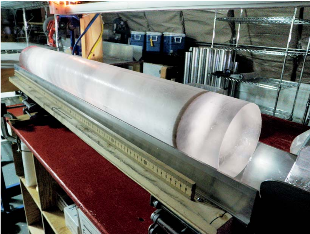
Figure 1. This section of ice core was drilled in December 2010 from the West Antarctic Ice Sheet. The layers of ice are visible, but also notable is a layer of volcanic ash deposited approximately 21,000 years ago.

scientific and popular publications. A global rhetoric has been central to establishing ice core science as meaningful, necessary, and reliable. Ice cores do a lot of other work, too. Ice core discourses, discussions, reporting, representations, and narratives have also shaped temporalities, the senses of time, in the contemporary world. The glaciologist and climatologist Paul Mayewski—who was chief scientist of the US Greenland Ice Sheet Project 2 (GISP2) between 1989 and 1993—has suggested that ice cores “have the power to transform our understanding of time.” Just as the space age had made humans and Earth seem spatially small, ice cores transform our “temporal consciousness” as “we locate ourselves within natural cycles that endure for thousands of years, and witness the random events that punctuate these patterns.” 5