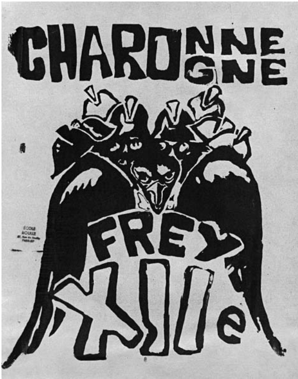
FIGURE 2 “Charonne/Charogne, Frey XIIIe.” Poster produced by the Ecole Boule, Paris, 1968. Public domain.

The historical context in which the events of 1968 are discussed can also dictate the presence or absence of subjects of historical research. At the time, as the largest general strike in French history, May 1968 was considered a world-historical event. However, relatively little of the research on the period now—an absence reflected in this issue—has focused on factory labor and unions, a development in line with deindustrialization and the decline in union size and strength in France and elsewhere in Europe and North America. 3 The 1968 years saw the last widespread expression in France of a belief in the creativity and morality of the project of workers engaged in labor conflicts as the driving force of social transformation. Over the last two decades, the primary concepts developed to allow the exploration of new facets of the period are the long 1968 or its variant, the 1968 years, and the global 1968. 4 Focusing on the breadth of the personal, social, political, ideological, and media networks, these concepts reveal important dimensions previous histories have occluded.