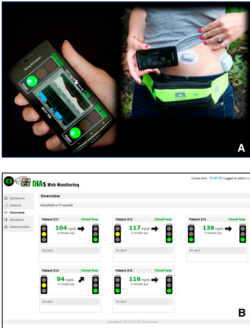
Figure 2 —A: Photos of the DiAs smart phone displaying CGM and insulin delivery traces (left) and the entire system worn by a study subject (right). B: Screenshot of the remote monitoring system operation during the trials at Sansum. Each of the five subjects participating simultaneously in these trials is represented by an icon on the computer screen. HYPO, hypoglycemia; HYPER, hyperglycemia.

by yellow hypoglycemia lights. There were no error messages. Each icon can be clicked during a monitoring session, which will display more detailed information for this subject, including detailed records of insulin delivery, glucose data, and the algorithm functions. Throughout the study, observation of the participants was performed mainly through the remote monitoring system, which proved to be a useful tool.