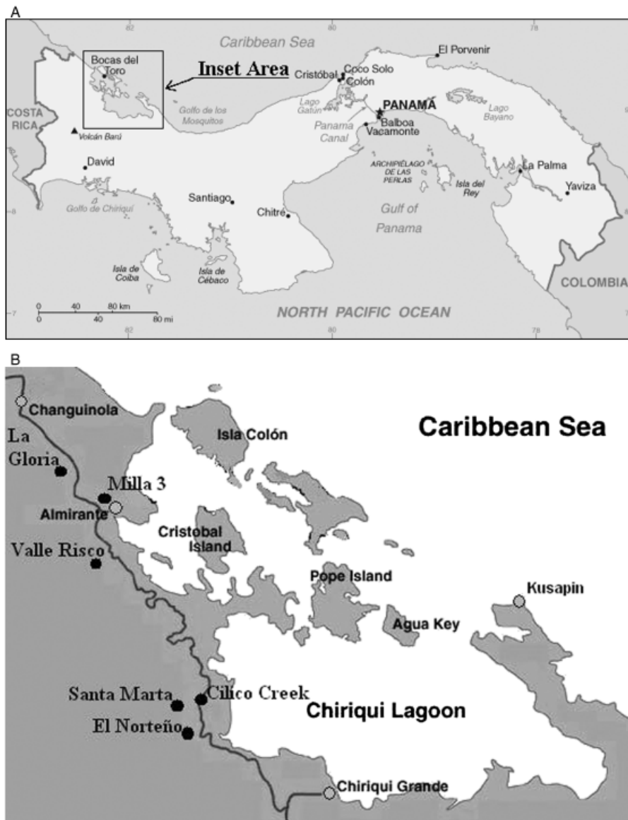
Figure 1 | A. Map of Panama showing inset area detailed below Adapted from http://en.wikipedia.org/wiki/Image:Pm-map.png which is based on the Central Intelligence Agency's World Factbook. B. Location of the six communities (indicated by dark circles) included in the survey. Adapted with permission of EnjoyCentralAmerica, http://www.enjoypanama.com/maps/bocas_del_toro.htm

sanitation engineers with the Peace Corps through the Master's International graduate school program ( http://cee.eng.usf.edu/peacecorps ). In our first unannounced observations, a designated community leader of the composting latrine project guided the researcher to the latrines in the communities. In our second set of observations, the researcher made an unannounced visit to the communities, accompanied by the closest residing Peace Corps volunteer. At each house the purpose of the visit was first explained and the owners