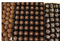
Clonality and heterogeneity

The relationship between tumor clonal heterogeneity and T-cell clonal expansion is controversial. Wolf et al. examine melanoma in a controlled system in which intratumoral heterogeneity and immunity are compared independent of mutational burden, revealing complex relationships between tumor clonal heterogeneity, mutational burden, and antitumor response. Joshi et al. track the T-cell repertoire in patients with non-small cell lung cancer (NSCLC). The expansion of TCR clones and their diversity and relatedness reflect the local diversity of mutations at any one NSCLC tumor site. Blood obtained at the time of tumor resection is informative for tracking and monitoring relevant neoepitope-specific T cells.