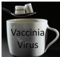
Boosting T-cell metabolism

Responses to oncolytic viruses are limited by immunosuppressive tumor microenvironments (TMEs). Oncolytic vaccinia virus (OVV) slightly delays tumor growth by increasing accumulation of non-exhausted, yet metabolically deficient, CD8 + T cells recruited to the TME. Leptin revitalizes the metabolism of CD8 + T cells, resulting in T cell-mediated delays in tumor growth.