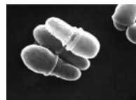
Malassezia predominates in pancreatic tumors

The complement system has emerged as an important component of the TME and tumor promotion. Fungi are found in pancreatic tumors, but the community of fungi in pancreatic tumors differs from that found in gut and normal pancreas. Tumors express a mannose-binding lectin that is cross-linked by fungi glycans to activate the complement cascade. Tumors also express the C3aR, and both the lectin and the C3aR are required for fungal-induced progression.