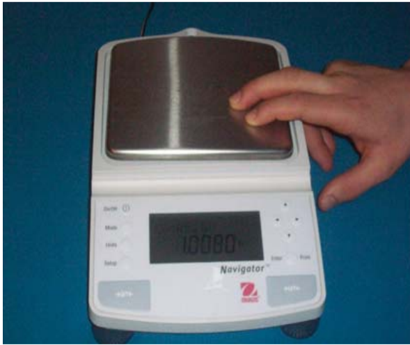
Figure 2. Identifying one pound of pressure using a digital scale. (Lesson #2, Activity A)