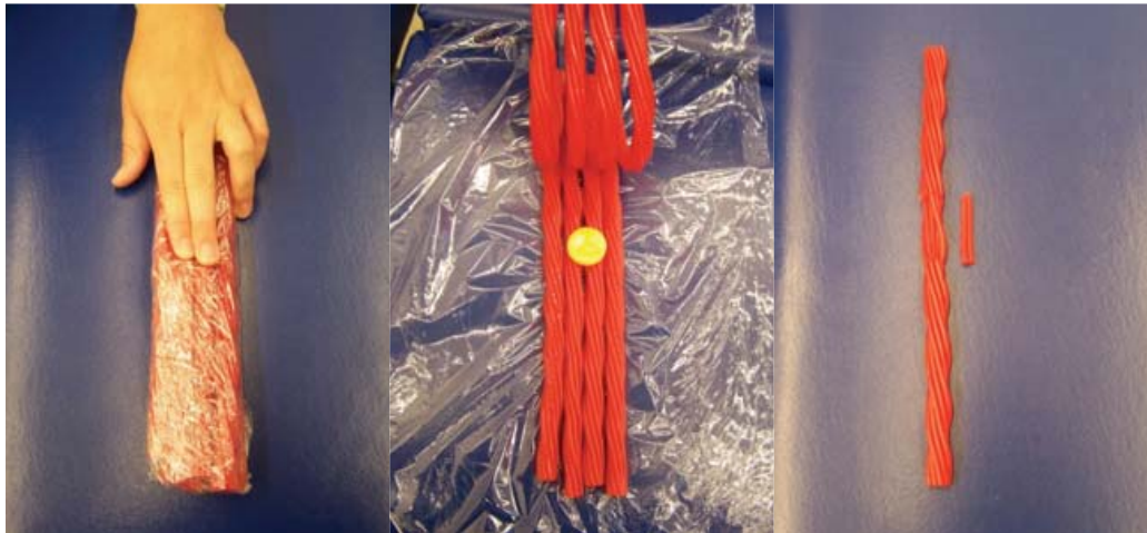
Figure 4. Simulating variable soft tissue injuries using licorice (Lesson #3)