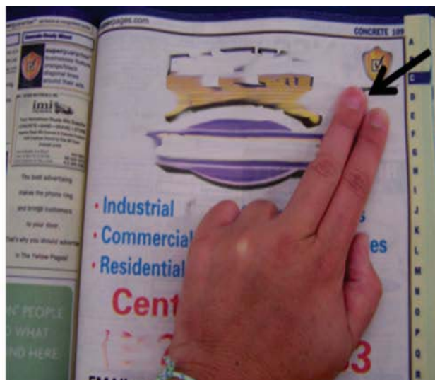
Figure 3. Understanding depth of pressure using thread and pages of a phonebook (Lesson #2, Activity B)