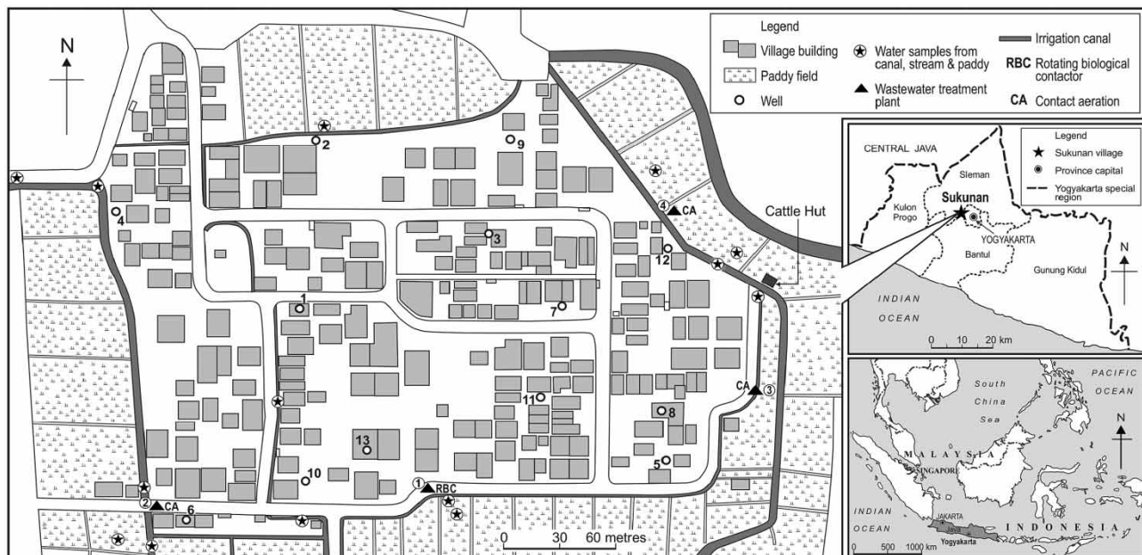
Figure 1 | Map of Sukunan Village showing the locations of the WWTPs and the surface and subsurface sampling points.

The climate of this region is humid equatorial but approaching monsoonal equatorial conditions according to