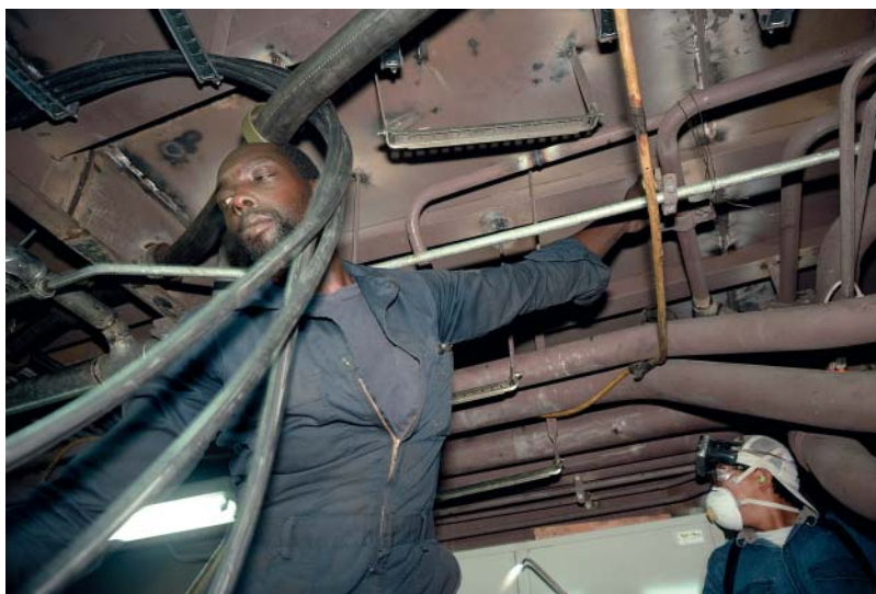
Fig. 2. Pipe fitters finishing the engine room of a tuna-fishing boat. Campbell Shipyard, San Diego harbor, August 1991. Originally published in Allan Sekula's Fish Story.

work, Christina Sharpe points out that the “Middle Passage” section of the book “bears no discernible relation to the planned disaster that is known by that name, nor to its long and ongoing effects.” 38 Sekula’s failure to reckon explicitly with the oceanic history of slavery, colonialism, and racial violence is, for Sharpe, an act of epistemological violence in itself. With reference to Sekula’s 2010 essay-film with Noël Burch, she notes that “the forgotten space is blackness.” 39 Here Sharpe deploys to withering effect one of the central onto-epistemological claims of Black thought, summarized neatly by Saidiya Hartman in this journal two decades ago: “On the one hand, the slave is the foundation of the national order, and, on the other, the slave occupies the position of the unthought.” 40 What is this unthought position? Sharpe is clear: it is the void of oceanic Blackness.