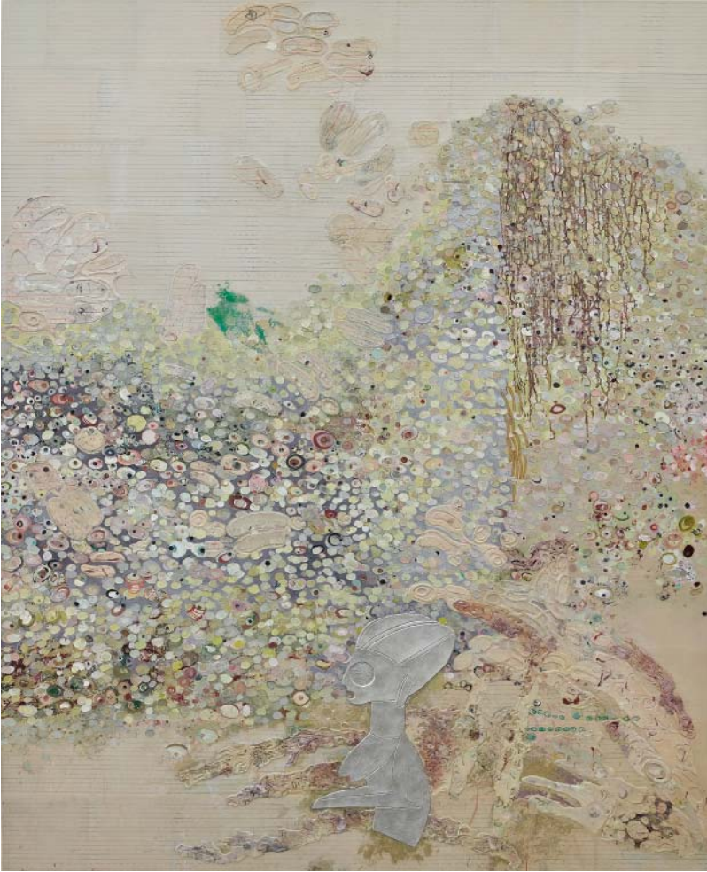
Fig. 5. Ellen Gallagher, Ecstatic Draught of Fishes (2019). Oil, pigment, palladium, and paper on canvas, 97.6 × 79.5 in (248.0 × 201.9 cm). © Ellen Gallagher.

of Fishes (1618–19), which depicts disciples pulling an enormous “draught” (or catch) of fish from the Sea of Galilee, the result of a miracle performed by Christ. The Rubens canvas was a compositional source for the nineteenth-century French Romantic painter Théodore Géricault’s Raft of the Medusa (1819), which depicts