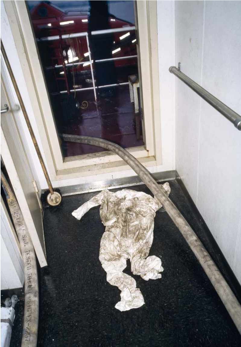
Fig. 3. Filling a lifeboat with water equivalent to the weight of a crew to test the movement of the boat falls before departure. Voyage 167 of the containership M/V Sea-Land Quality from Port Elizabeth, New Jersey, to Rotterdam, November 1993. Originally published in Allan Sekula's Fish Story .