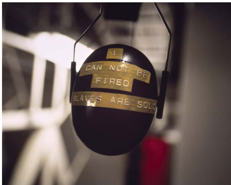
Fig. 4. Engine-room wiper's ear protection. Voyage 167 of the containership M/V Sea-Land Quality from Port Elizabeth, New Jersey, to Rotterdam, November 1993. Originally published in Allan Sekula's Fish Story .

Ecstatic Draught of Fishes (2019) (fig. 5), which graces the cover of this special issue, Gallagher layers oil paint, ink, gold leaf, and paper to produce a pale field of intricate, overlapping forms and subtly shifting hues. The piece is unmistakably abstract, but its terrain-like composition, its topographic repetitions, its variously weighted lines, and its amoebic splotches of color hint at some underlying structure or hidden representational function. The work is in tension with itself in various ways: it exudes stillness, even calm, but vibrates with pent-up energy; it is both rigorously conceived—note the faint gridded lines at the top and bottom—and simultaneously spontaneous, as in the dripped paint at right. And what to make of the silver visage near the bottom of the canvas?