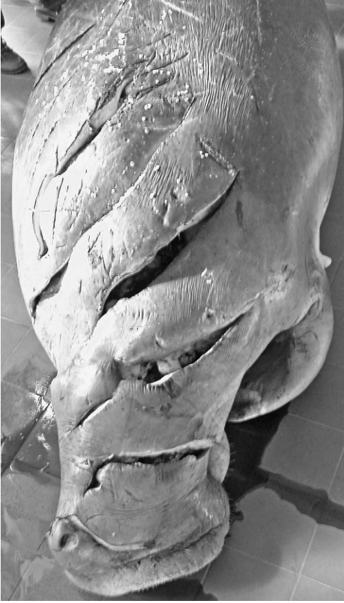
FIGURE 1. Dugong ( Dugong dugon ) carcass (case 17) from southeast Queensland, Australia, collected in 2004. Figure shows multiple deep, linear, and parallel cuts on the craniodorsal surface, consistent with a boat strike.

3-m section of small intestine was dark red to black from congestion and necrosis caused by a >180^\circ volvulus in the corresponding mesentery. The diagnosis was peritonitis with septicemia or toxemia.