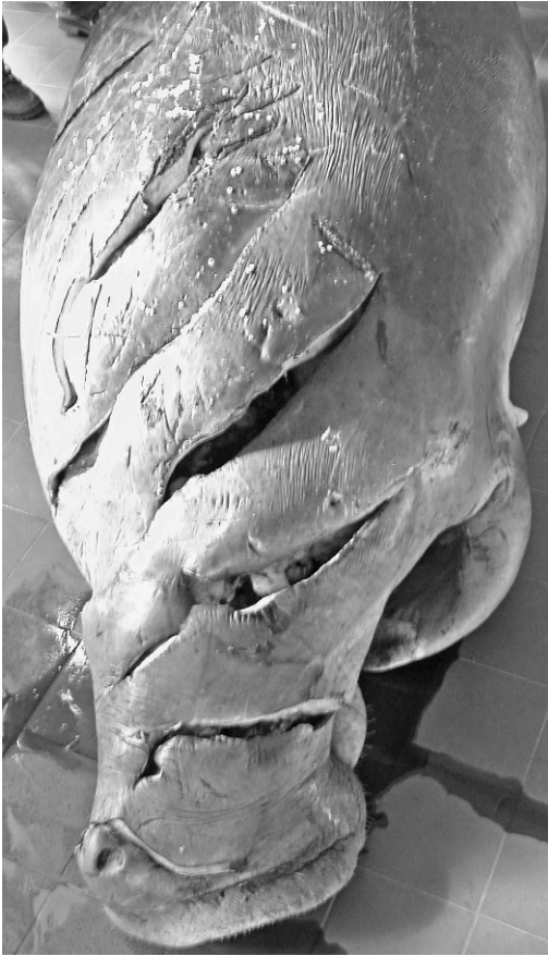
FIGURE 1. Dugong ( Dugong dugon ) carcass (case 17) from southeast Queensland, Australia, collected in 2004. Figure shows multiple deep, linear, and parallel cuts on the craniodorsal surface, consistent with a boat strike.

3-m section of small intestine was dark red to black from congestion and necrosis caused by a >180^\circ volvulus in the corresponding mesentery. The diagnosis was peritonitis with septicemia or toxemia.