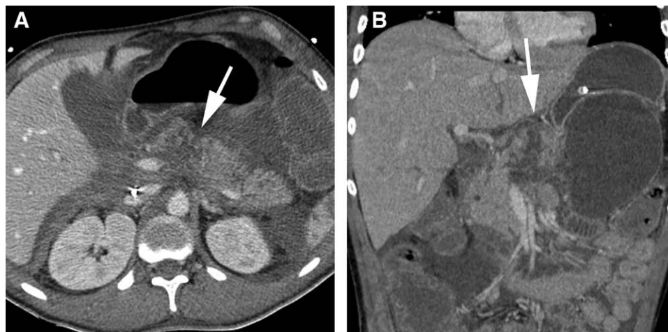
Fig. 1. Computed tomography (CT) scan showing the traumatic fracture of the pancreas ( white arrows ). (A) Axial contrast-enhanced CT scan (venous phase); (B) Coronal contrast-enhanced CT scan (venous phase).

of 3 l of serous liquid associated with rupture of the Wirsung duct were evacuated and drained. Broad-spectrum antibiotics (piperacillin-tazobactam, amikacine, and fluconazole) were initiated. A new tomodensitometry scan was performed on day 30 because of clinical deterioration and suspicion of a pancreatic fistula (fig. 1). The pancreatic fistula was confirmed as well as chemical peritonitis and gangrenous cholecystitis. A second laparotomy was carried out for cholecystectomy, peritoneal lavage, and drainage. In the postoperative period, a massive hemorrhagic shock related to venous diffuse bleeding of the pancreas required surgical hemostasis, which was finally impossible. The patient died on day 30 after refractory ventricular tachycardia and fibrillation secondary to uncontrolled massive hemorrhage.