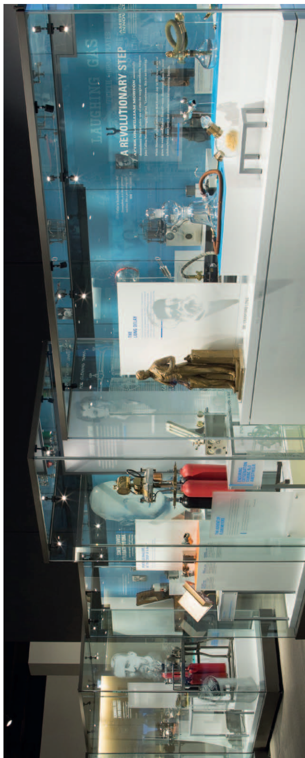
Fig. 2. The Wood Library-Museum's Legacy Hall Floor Cabinets. In the right foreground is the replica Morton Ether Inhaler. Flanking it are two glass inhalers, the bell-shaped 1846 Hooper and the conical 1847 Charrière, each of which was curatorially