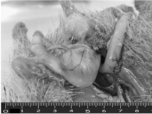
FIGURE 1. A free-living adult female European hedgehog ( Erinaceus europaeus ) admitted to the Wildlife Rehabilitation Center of Parque Biológico de Gaia, Avintes, Portugal, in August 2015 because of hypothermia, malnourishment, and slow, uncoordinated movements. Macroscopic lesions observed in necropsy include ascites and uterine distention due to pyometra. After being retracted caudally, the uterus measured 5×2 cm of the body and 0.5-cm diameter in the uterine horns, containing purulent exudate.

hyperplasia and inflammatory infiltrates (neutrophils, macrophages, and lymphocytes) on the uterine lamina propria (Fig. 2); granulomatous pneumonia with inflammatory infiltrate of macrophages, giant cells, and septic