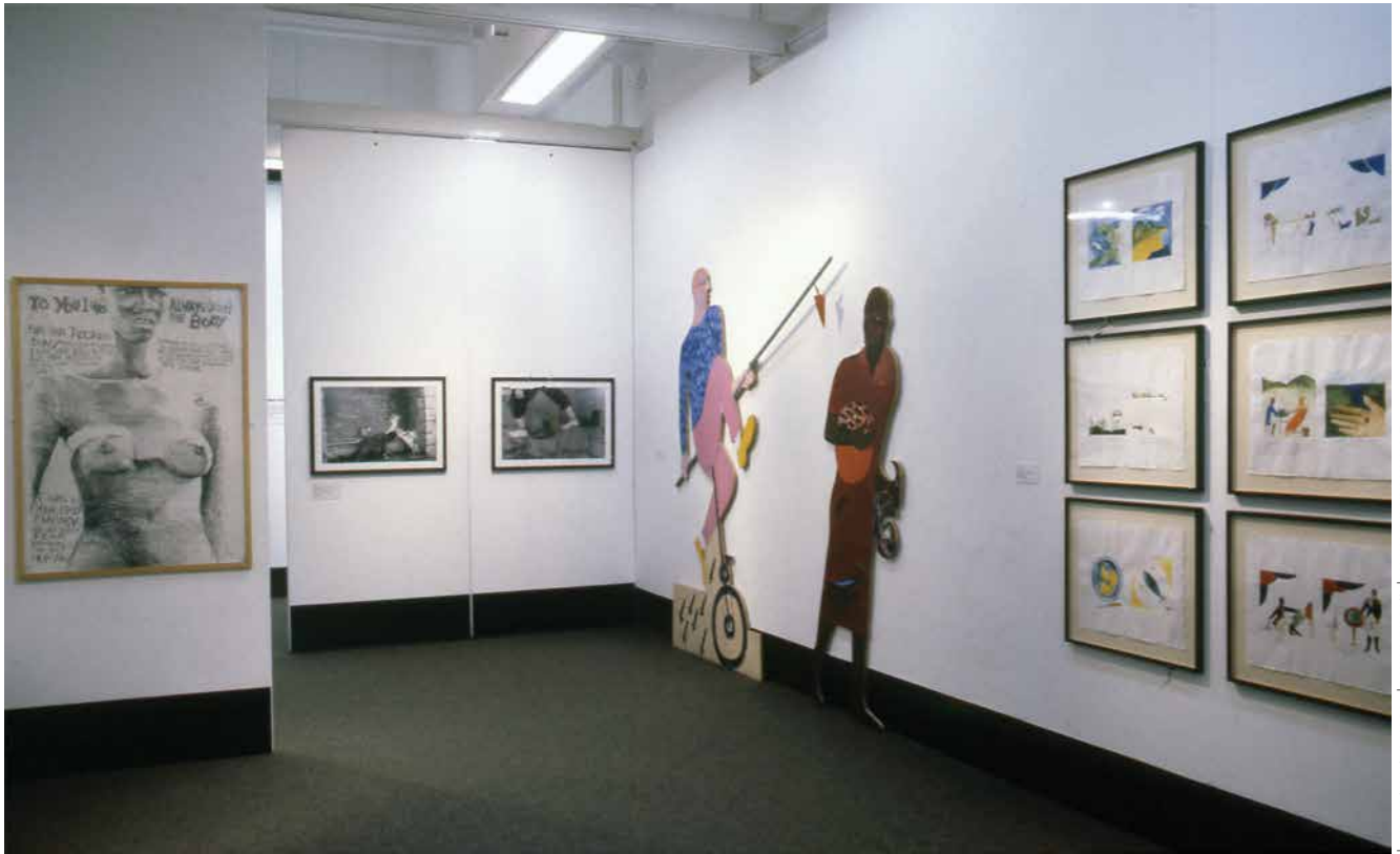
Installation view of The Other Story: Asian, African, and Caribbean Artists in Post-War Britain exhibition, Wolverhampton Art Gallery, March 10–April 22, 1990, showing work by Keith Piper, Mona Hatoum, and Lubaina Himid.

thing to see a black artist's exhibition in Birmingham or Manchester; it is quite another thing to see a black artist's exhibition in Cumbria or Penzance.