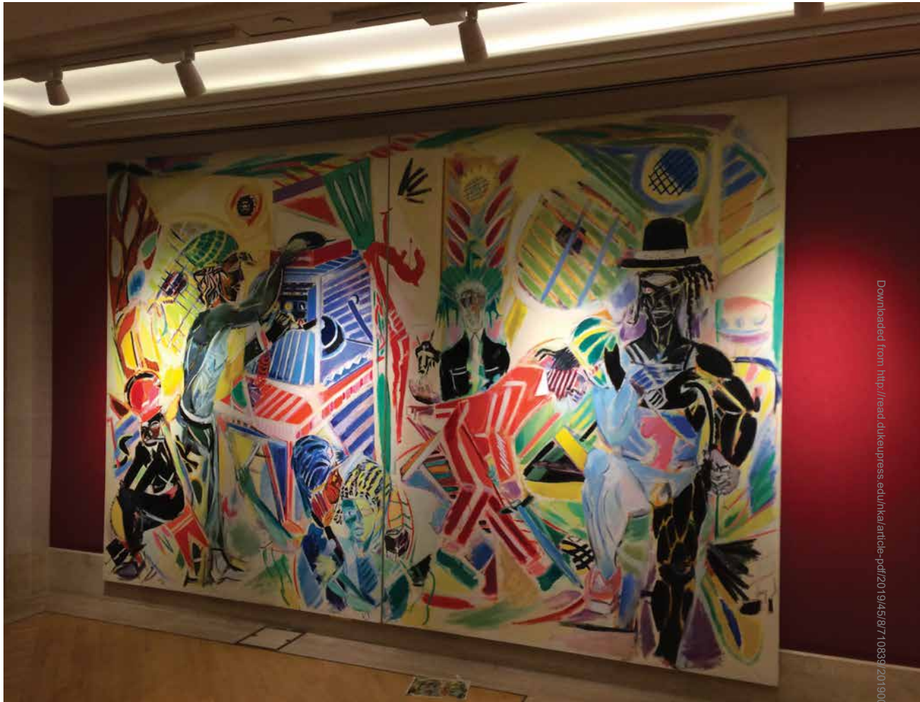
Denzil Forrester , Witch Doctor , 1983. Oil on canvas, 240 x 360 cm. Installation view of No Colour Bar: Black British Art in Action 1960–1990 exhibition, Guildhall Art Gallery, London, July 10, 2015–January 24, 2016.

of functional obscurity. Might the late twentieth and early twenty-first century recognition of a clutch of favored black British artists have opened the way for newer and different types of scholarship on these and perhaps also other practitioners?