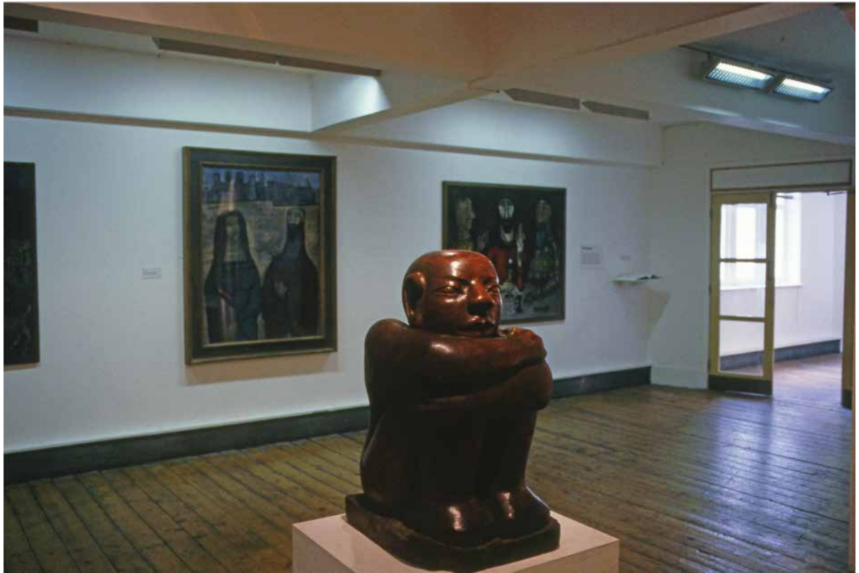
Ronald Moody, The Onlooker, 1958. Teak, 65 x 32 x 38 cm. Installation view of The Other Story: Asian, African, and Caribbean Artists in Post-War Britain exhibition, Cornerhouse, Manchester, May 5–June 10, 1990.