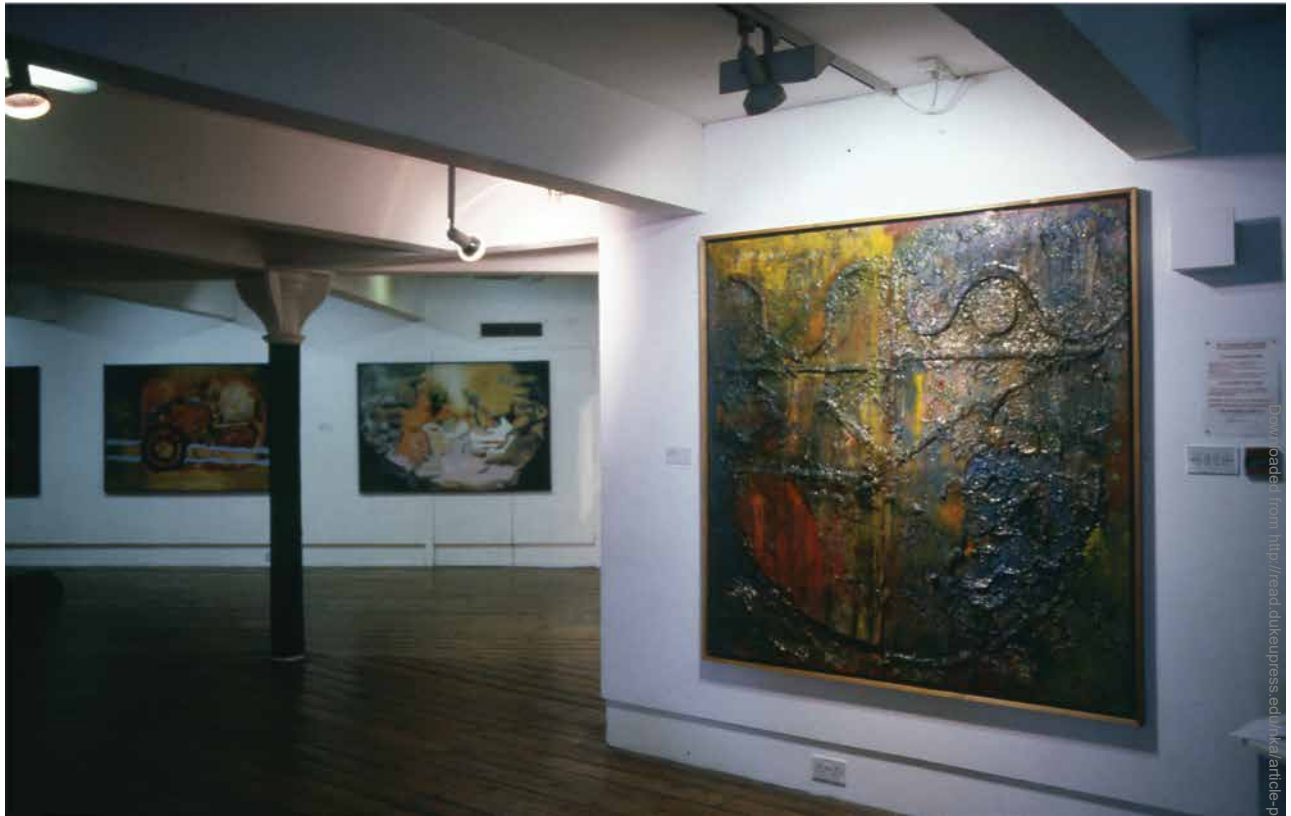
Foreground: Frank Bowling, Gate, 1986. Acrylic on canvas, 167 x 165 cm. Background: works by Aubrey Williams. Installation view of The Other Story: Asian, African, and Caribbean Artists in Post-War Britain exhibition, Cornerhouse, Manchester, May 5–June 10, 1990.

African American practitioners); and perhaps most significant of all, the meteoric rise to art-world superstardom of artists such as McQueen, Ofili, and Shonibare. The success of artists like McQueen, Ofili, and Shonibare was, quite simply, historically unparalleled and included Turner Prize wins, representing Britain at the Venice Biennale, and no end of media adulation. We can also put into the thirty-year post- The Other Story era the rise and fall of the Arts Council-sponsored Institute of International Visual Arts, more commonly known by its acronym, INIVA, the letters being presented in varying assortments of upper and/or lower-case characters. Such developments can, in some respects, be seen as providing a backdrop or context for this current issue of Nka .