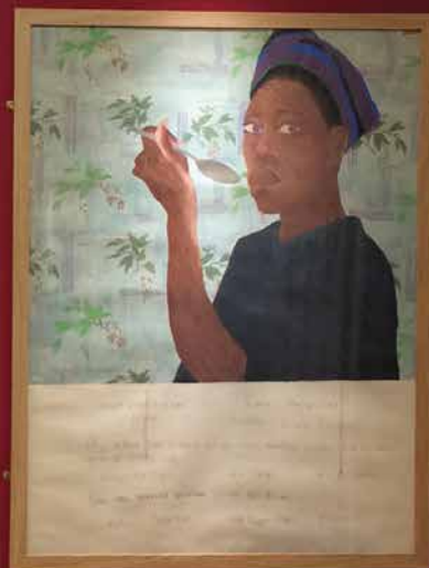
Left: Sonia Boyce, She Ain't Holdin' Them Up, She's Holdin' On (Some English Rose), 1986. Crayon, chalk, pastel, and ink on paper, 218 x 99 cm. Right: Sonia Boyce, Rice n Peas, 1982. Oil on canvas. Installation view of No Colour Bar: Black British Art in Action 1960–1990 exhibition, Guildhall Art Gallery, London, July 10, 2015–January 24, 2016.

Yinka Shonibare have all made a trip, or several trips, to Buckingham Palace to collect awards such as (in ascending order of status and importance) Member of the Most Excellent Order of the British Empire (MBE), Officer of the Most Excellent Order of the British Empire (OBE), or Commander of the Most Excellent Order of the British Empire (CBE). Though it appeared that among people from an ethnic minority background accepting such honors the majority were given the MBE, David Adjaye, the architect and sometime collaborator with painter Chris Ofili, was awarded one of the supreme (male) “gongs”: a knighthood, entitling him, as a knight of the realm, to be referred to and addressed as “Sir David.” Added to the above are the not insignificant