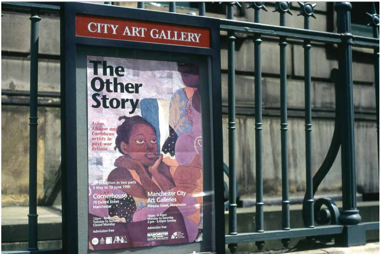
Poster for the exhibition The Other Story: Asian, African, and Caribbean Artists in Post-War Britain, Manchester City Art Gallery, May 5–June 10, 1990.