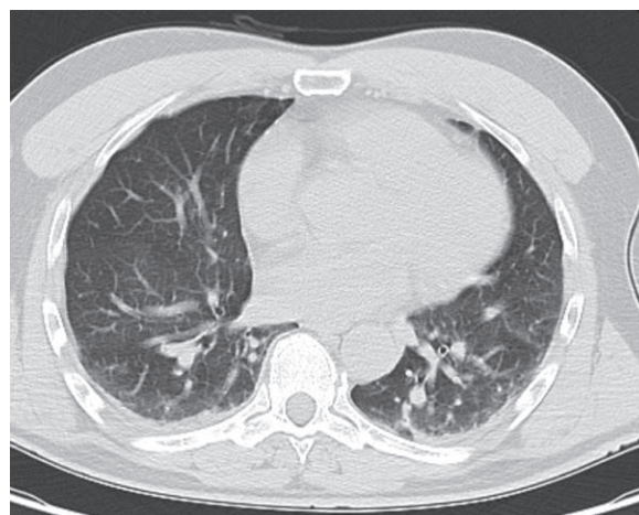
Fig. 3. Example of a postoperative computed tomography scan. The area of atelectasis in this patient, 4.6 cm 2 (2.5% of total lung area), corresponds to the median area of postoperative atelectasis in all participating subjects. Computed tomography scan was performed at end expiration, 5 mm above the right diaphragm dome approximately 30 min after extubation.

The Hamilton T1 ventilator lacks a pure volume-controlled mode. The ventilation mode that was used in this study is very similar but automatically adjusts the peak inspiratory pressure to the lowest level possible while still maintaining the target tidal volume. Although the set PEEP level is maintained at all times, occasionally, this mode can deliver slightly higher or lower tidal volumes. We believe it is unlikely to have influenced the results of the study, because the patients in both groups were ventilated with the same ventilator.